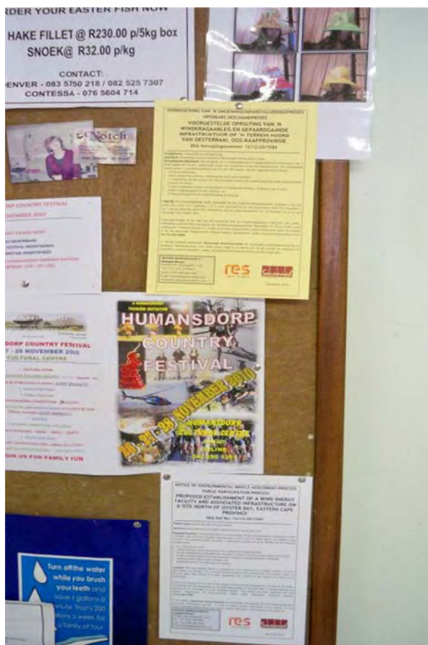
Figure 7: Notice Placed on the Humansdorp library notice board.