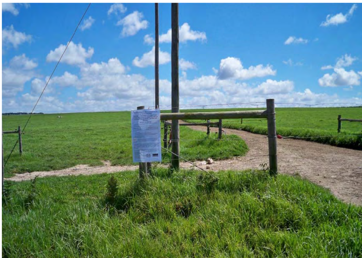
Figure 4: Site Notice Placed in front of Farm portion Rebok Rant 715/4.