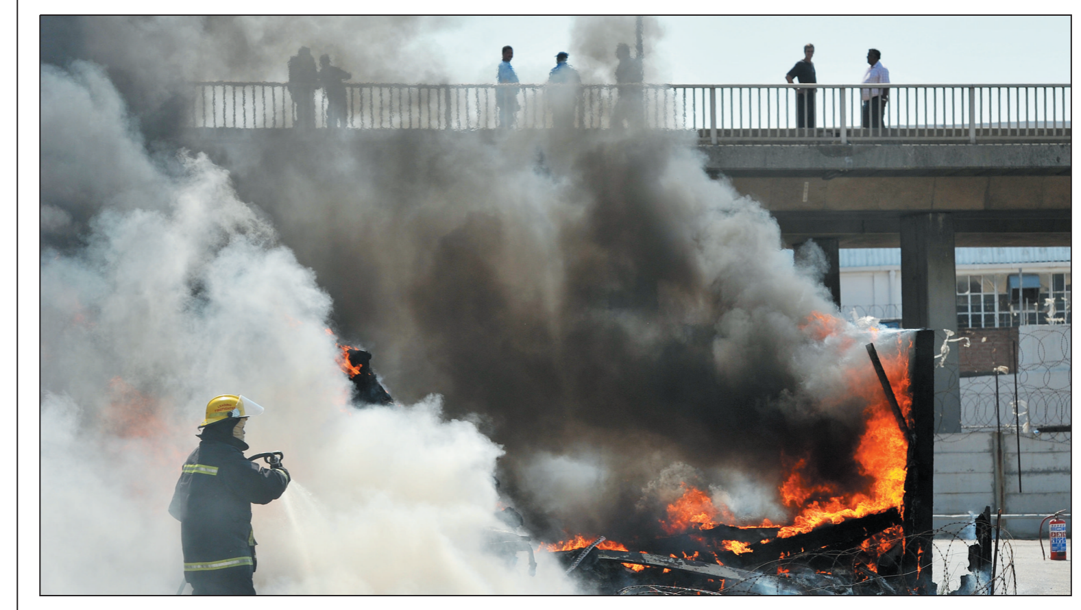
Brandweermanne van die Nelson Mandelabaai-metro blus die vlamme terwyl nuuskieriges van bo af toekyk.