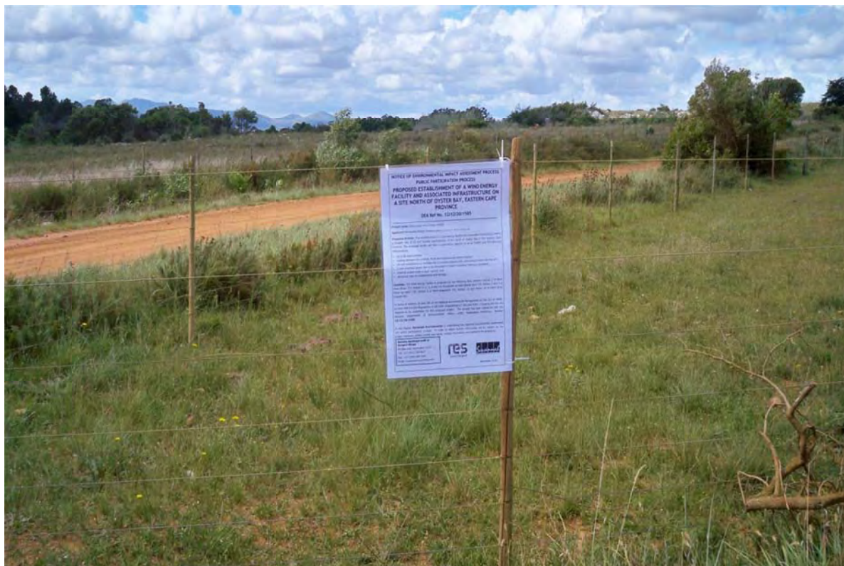
Figure 3: Site Notice Placed in front of Farm portion Kruis Fontein 681/10 along the R330 road.