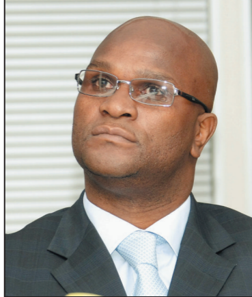
Mnr. Nathi Mthethwa