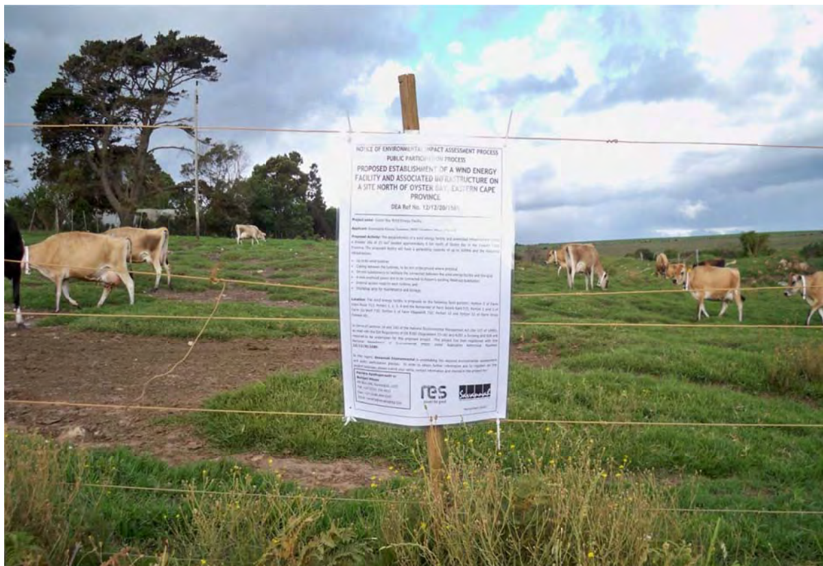
Figure 1: Site Notice Placed in front of Farm portion Rebok Rant 715 RE along the Humansdorp road.