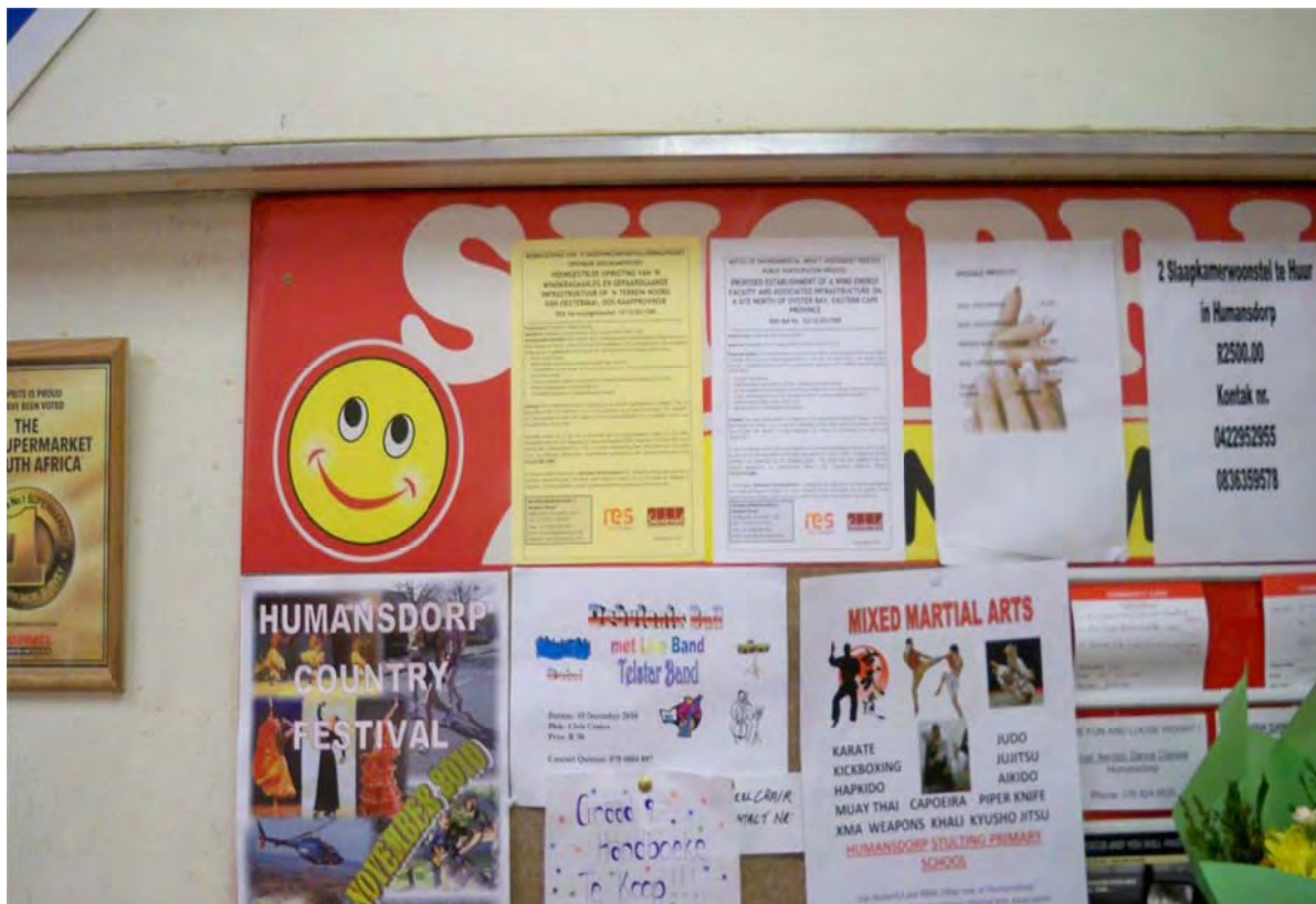
Figure 5: Site Notice placed at the Humansdorp Shoprite community notice board