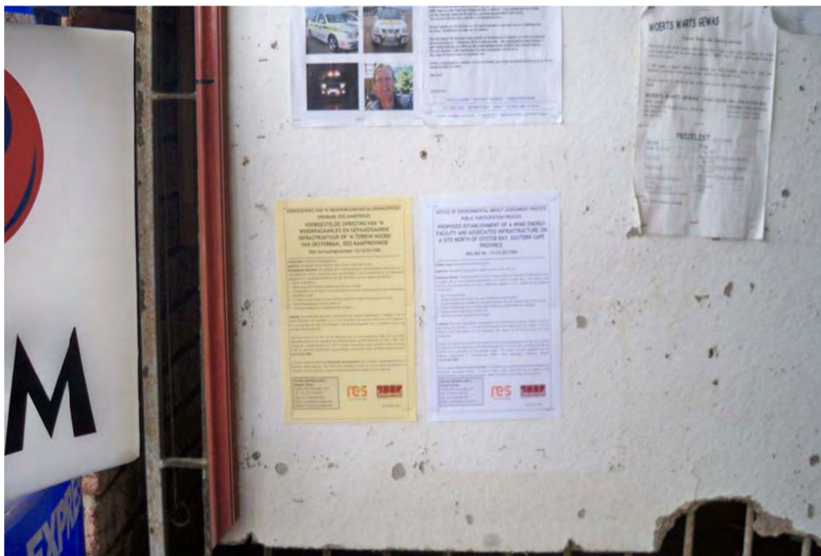
Figure 6: Site Notice placed at the Oyster Bay Shop community notice board