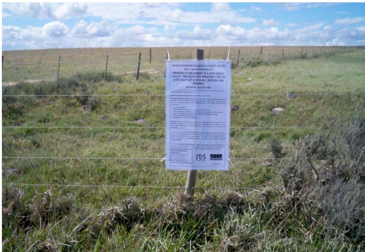
Figure 2: Site Notice Placed in front of Farm portion Ou Werf 738/3 along the Oyster Bay road.