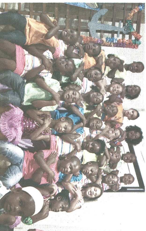
Dis So Lekker Om Die Here Te Dien, sing dié spannetjie.