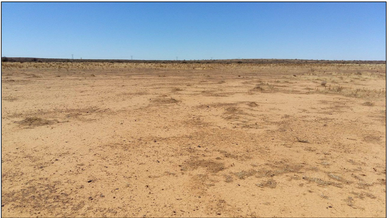
Figure 4. There are pans in the vicinity of the PV 3 footprint which correspond with the Bushmanland Vloere vegetation type. These areas are considered unsuitable for PV development.