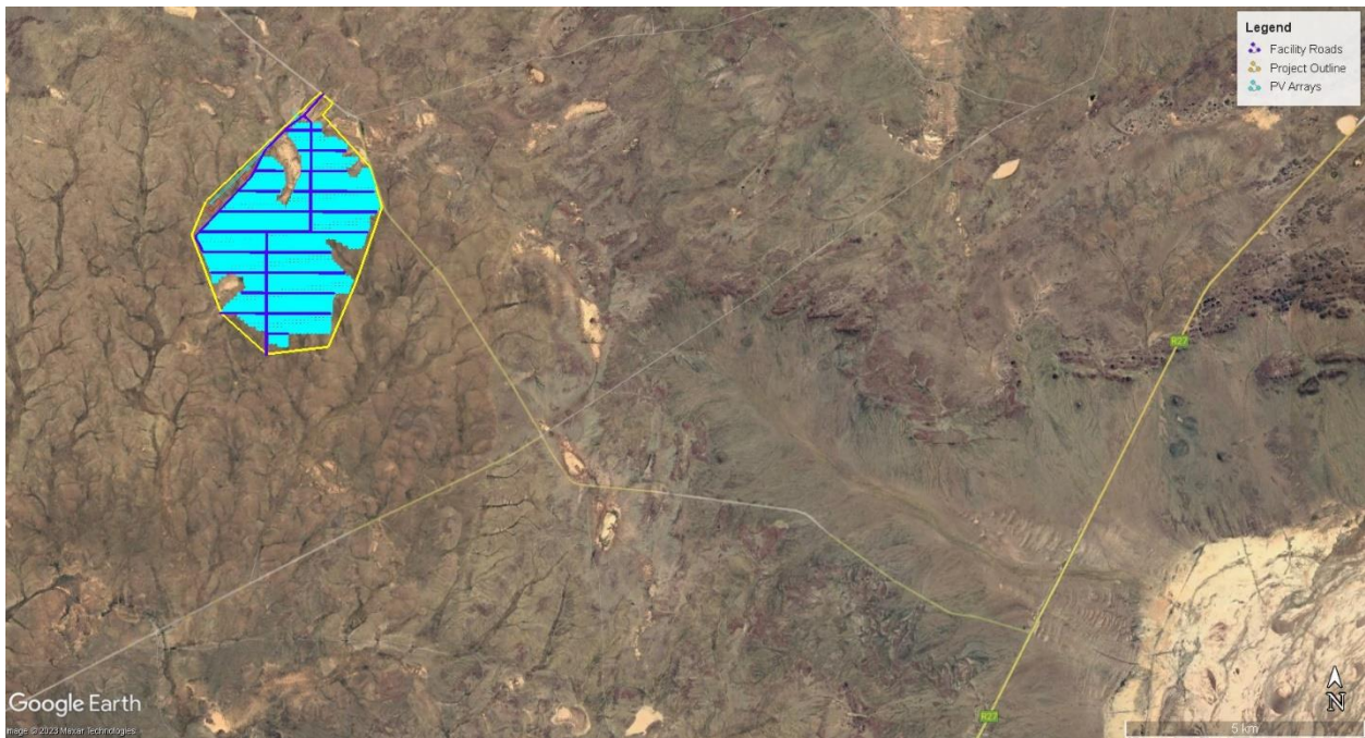
Figure 1. Satellite image showing the location of the proposed Kotulo Tsatsi PV 3 development, west of the R27, located between Kenhardt and Brandvlei.