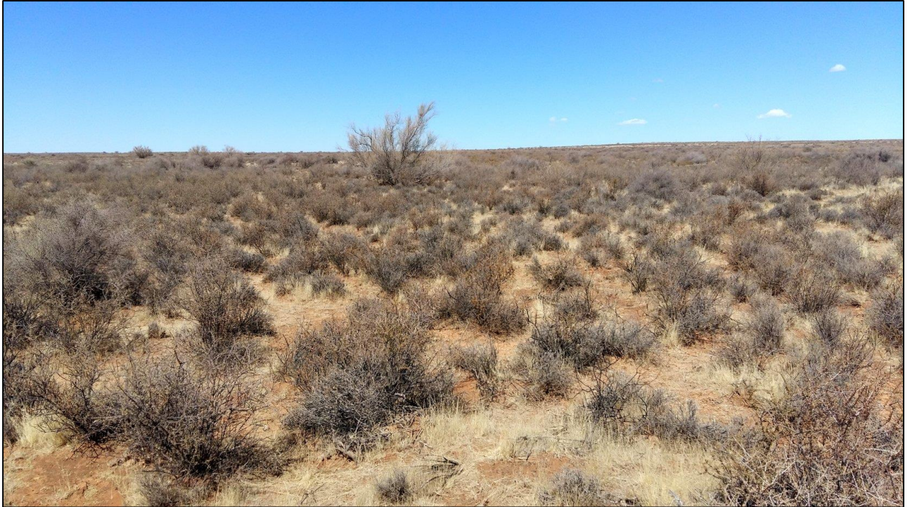
Figure 3. Typical open plains within the Kotulo Tsatsi PV 3 site representing the Bushmanland Basin Shrubland vegetation type.