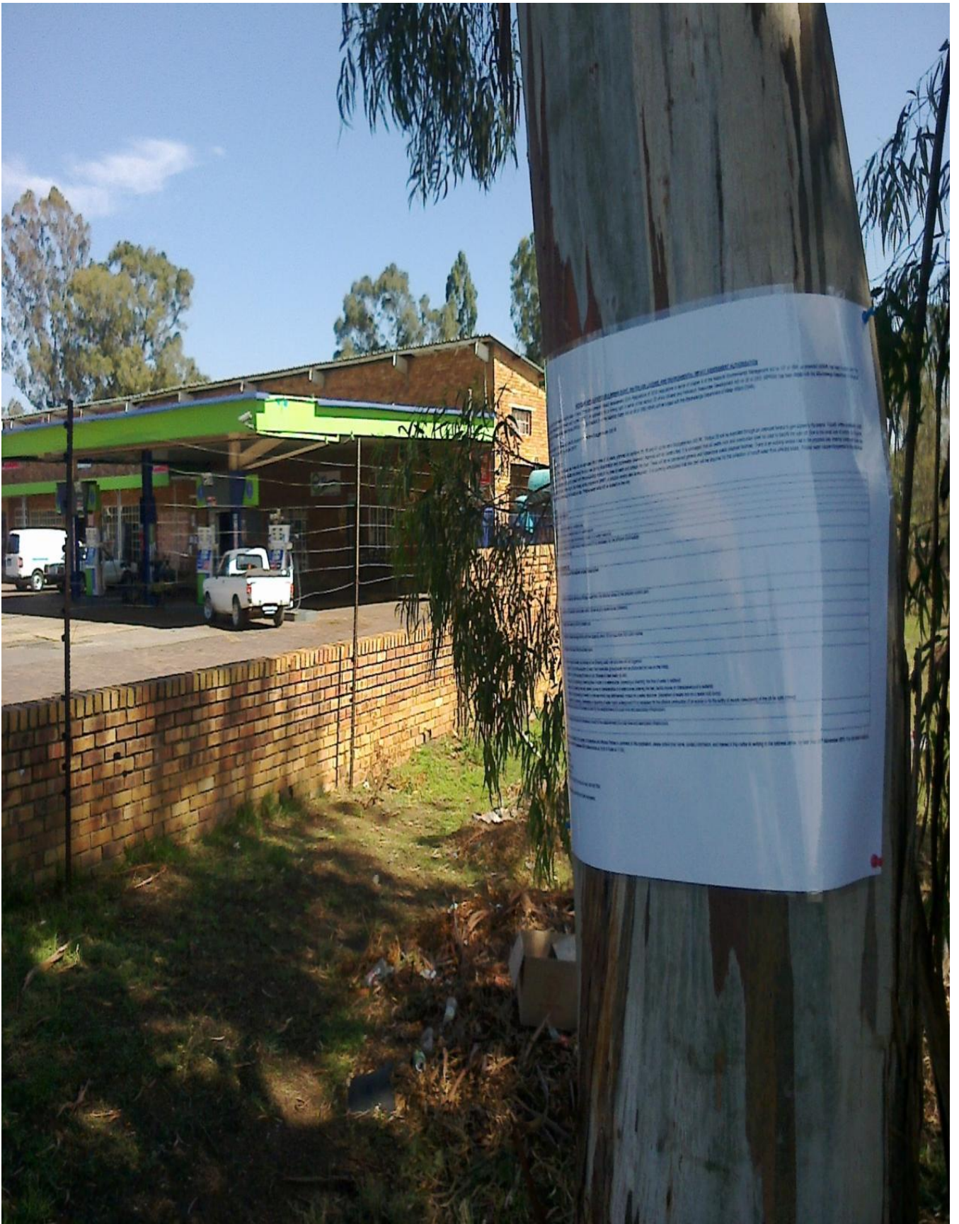
Filling Station at overpass