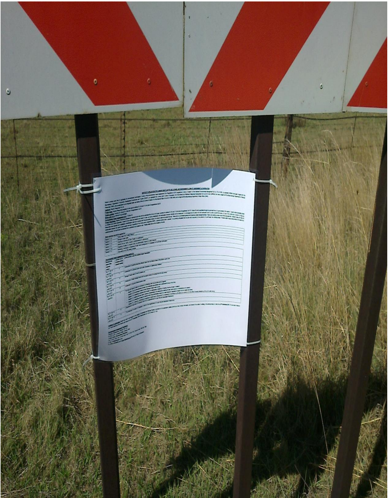
Junction overpass and mini street