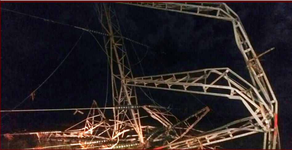
The Theseus/Beatrix 132 kV line damaged by storms

Theunissen and Masilo Township. "While we are doing everything within our power to recover electricity supply as speedily as possible, repairing damage of this magnitude will take time. We ask for patience while we restore supply and urge the communities in the affected areas to be safe by avoiding all electrical structures and lines. Electricity supply can be switched on without notice. We advise consumers to switch off all electrical sockets and appliances and to treat all electrical connections as live and dangerous, said Eskom in a statement. For more information and updates, customers can contact the Eskom Contact Centre on 08600 ESKOM (08600 37566).