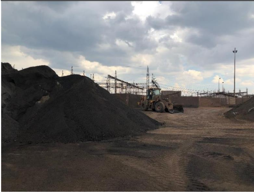
Figure 5: General view of the site.