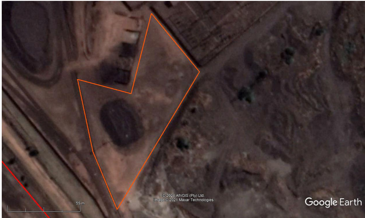
Figure 4: Detailed view of the site.

An HIA must be done under the following circumstances: