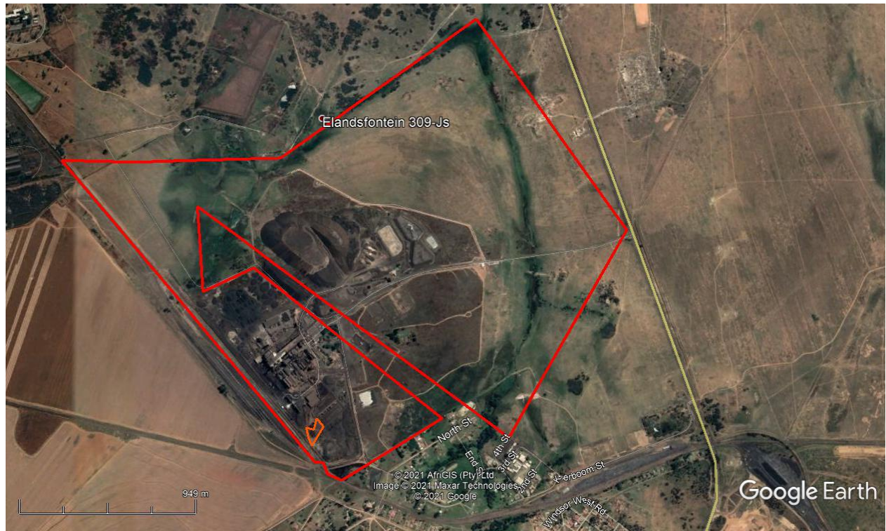
Figure 2: Location of the site (orange outline) within the Transalloys site (red outline).