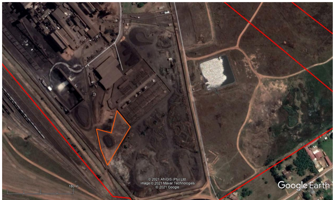
Figure 3: Closer view of area surrounding the development area.