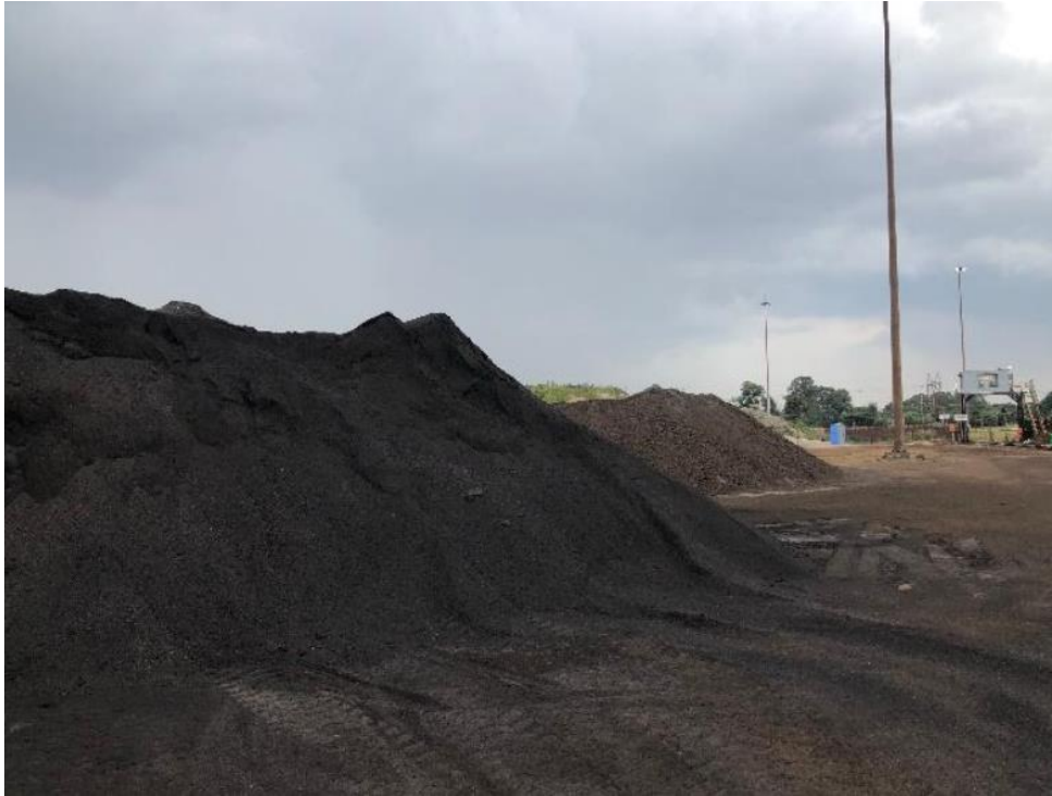
Figure 7: Note stockpiles currently on site.

It needs to be mentioned that during the mentioned survey one grave yard was identified. This site lies approximately 1,25 km north-east of the site where the development is planned and thus no impact is foreseen (Figure 8). For the grave site, a management plan was also compiled in 2015 (Van Vollenhoven 2015). 2 The site is managed in terms of this management plan and is thus mitigated by constant inspection and monitoring protocols. It is therefore believed that the proposed development will also not have an impact on the graves.