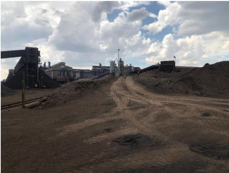
Figure 6: Another view of the site. Note the infrastructure on site.