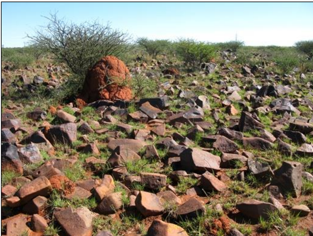
Fig. 7. Angular blocky surface gravels overlying the outcrop area of the Allanridge Formation on the eastern edge of the study area. These surface deposits, generated by in situ weathering and downwasting, appear to be mapped as fluvial High Level Gravels in Fig. 1.