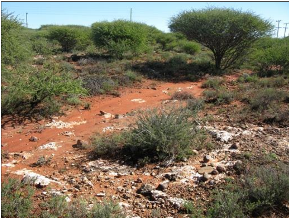
Fig. 11. Shallow stream incision through surface Kalahari sands to expose underlying pale calcretes and downwasted coarse gravels (Loc. 498).