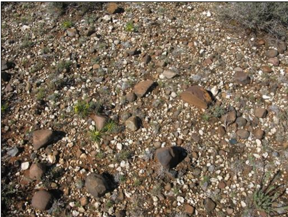
Fig. 9. Polymict surface gravels in the flat area due NE of the substation. Note some well-rounded clasts of probably fluvial origin as well as abundant reworked pale calcrete fragments (Loc. 497).