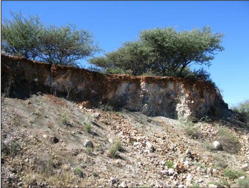
Fig. 10. Section through thick calcrete hardpan capping the Dwyka outcrop area. The irregular undulating contact with overlying reddish brown gravelly soils suggests karstic solution weathering (Loc. 494).