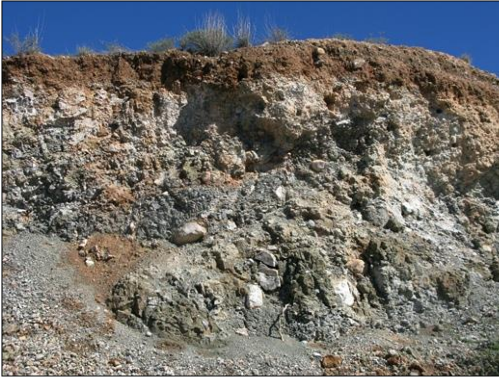
Fig. 4. Weathered and secondarily calcretised Dwyka Group tillites containing boulder-sized erratics and capped by reddish-brown gravelly soils (Loc. 494).