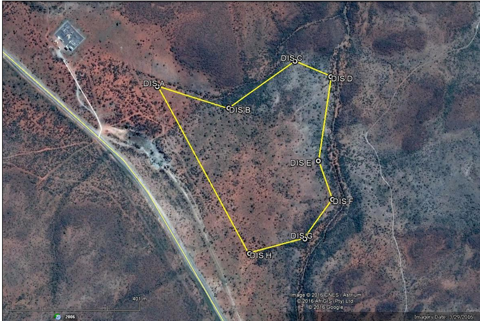
Fig. 13. Google earth© satellite image showing the revised study area for the Disselfontein Keren Solar Plant situated on the Remainder of Farm 77, Hopetown, close to the west bank of the Orange River and 23.5 km NW of Hopetown, Northern Cape (yellow polygon). Note that the previous field study (Almond 2012b) focused on the adjoining original study area situated close to the substation and quarry area to the northwest and west.