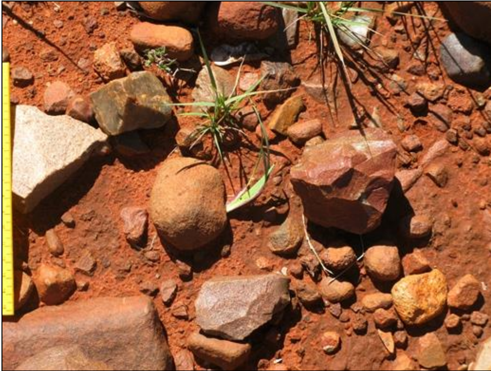
Fig. 8. Finer gravels on surface between the large blocks seen in the previous figure (Scale in cm). Gravels here consist of Allanridge lavas, vein quartz and quartzite (many of the quartzite clasts are flaked) overlying orange-brown Kalahari sands.