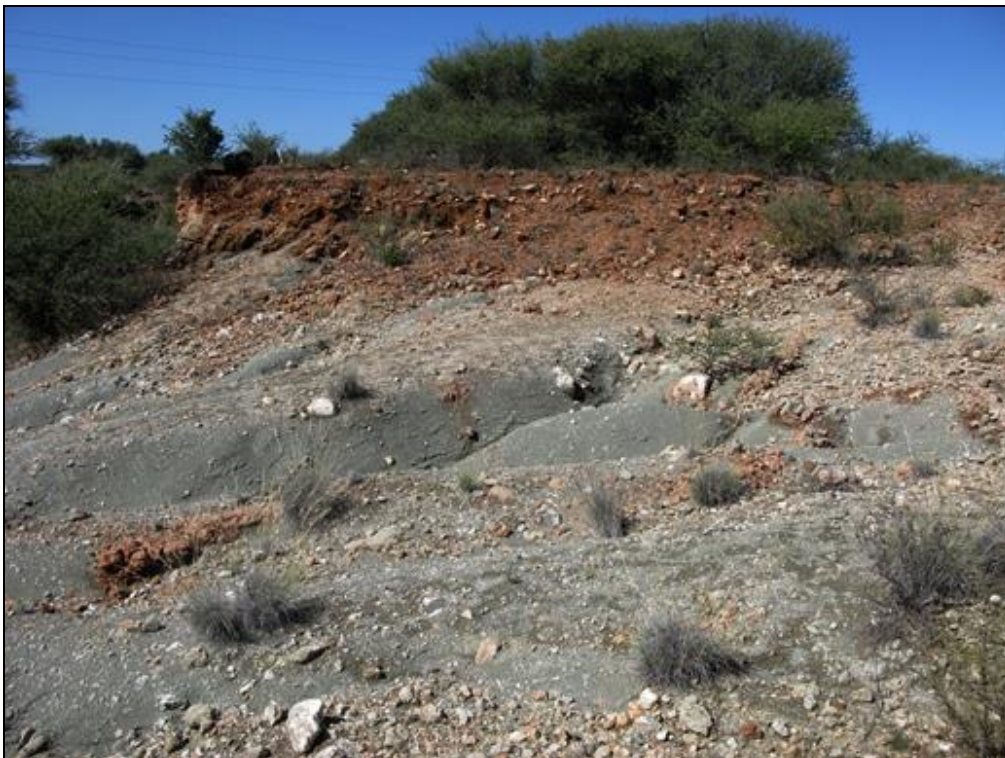
Fig. 3. Good quarry exposure of massive to thin-bedded grey Dwyka tillites with brownish diagenetic carbonate lenses (bottom LHS), sparse boulder-sized erratics and mantle of calcrete, well-bedded reddish-brown gravels and sandy soils (Loc. 494).