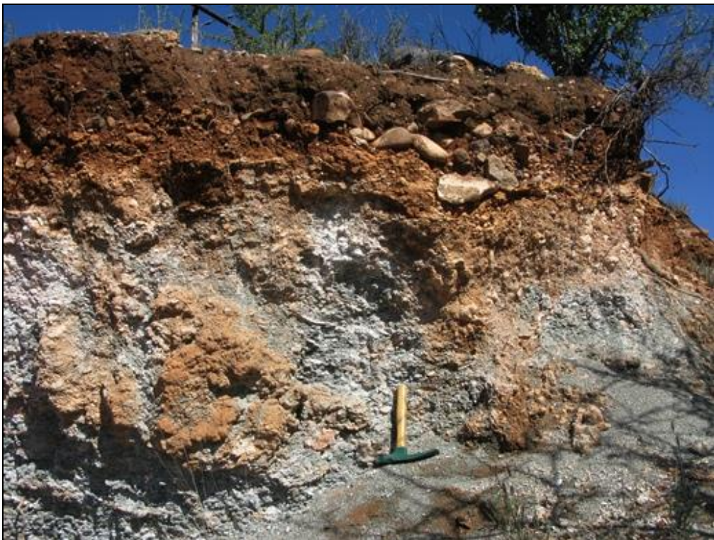
Fig. 5. Detail of upper, pervasively calcretised Dwyka Group sediments, overlying reddish-brown gravels and brown surface soils (Loc. 494) (Hammer = 27 cm.).