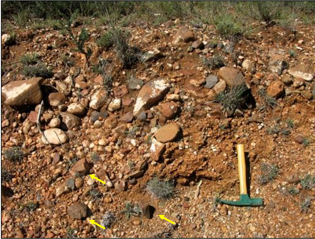
Fig. 6. Poorly sorted gravel lens overlying Dwyka Group outcrop. Clasts vary from angular to well-rounded and several are flaked (arrows), suggesting a Pleistocene or younger age (Loc. 494) (Hammer = 27 cm).