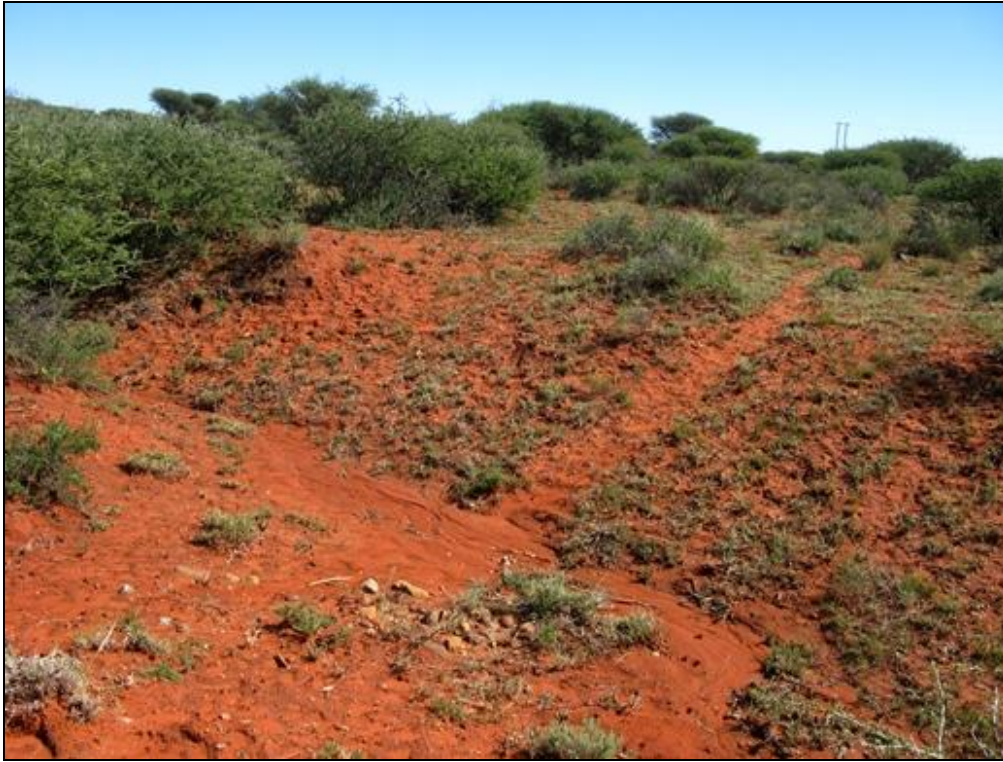
Fig. 12. Deep orange-hued Kalahari aeolian (wind-blown) sands mantling the western portion of the study area.