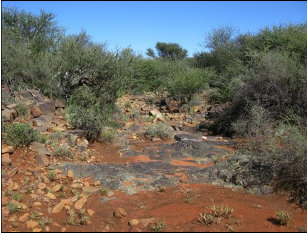
Fig. 2. Stream incision into greenish-grey, blocky-jointed lavas of the Allanridge Formation to the north of substation (Loc. 496).