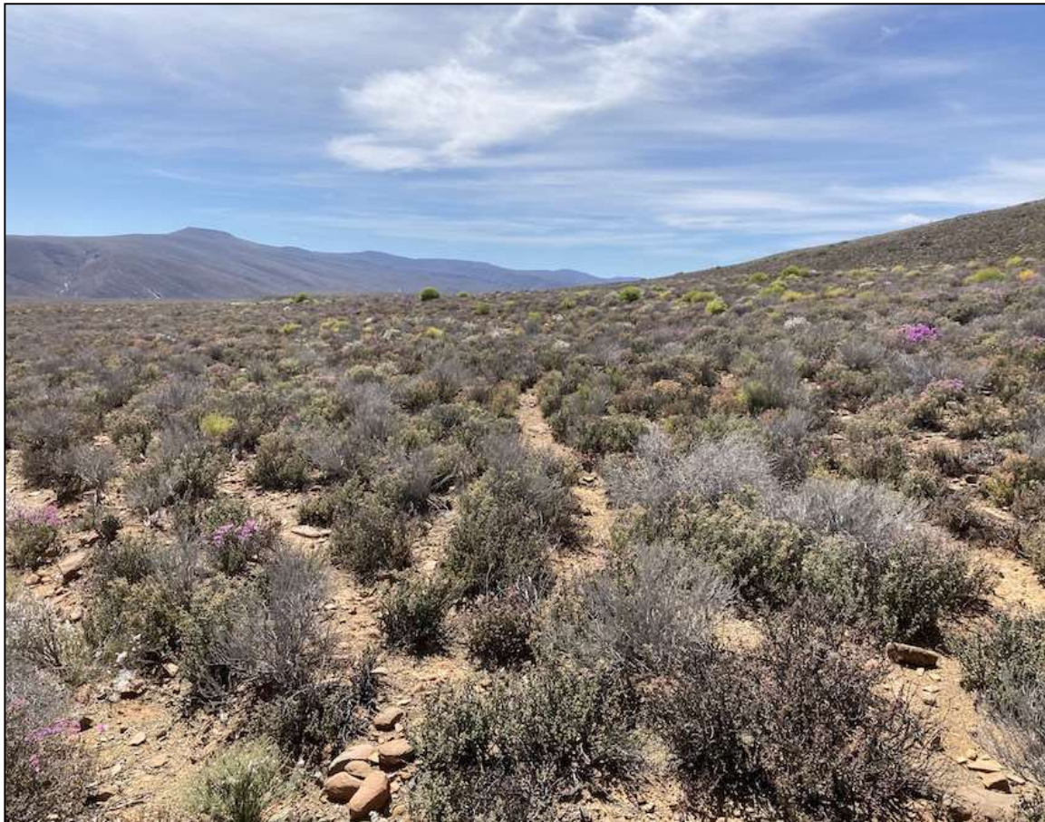
Figure 2: Typical vegetation on site

There are two regional vegetation types occurring in the general area, namely Koedoesberge-Moordenaars Karoo and Central Mountain Shale Renosterveld, which occur in the hills between the Great Escarpment close to Sutherland and the plains close to Laingsburg and Matjiesfontein. The vegetation on site is typical of this vegetation type that occurs on stony soils within these low mountain ranges. The vegetation is a low succulent scrub and dotted by scattered tall shrubs, patches of 'white' grass visible on plains, the most conspicuous dominants being dwarf shrubs of Pteronia , Drosanthemum and Galenia . Commonly occurring species on site include, in order of frequency of occurrence, Ruschia intricata , Gorteria alienata , Pteronia glauca , Aizoon africanum ,