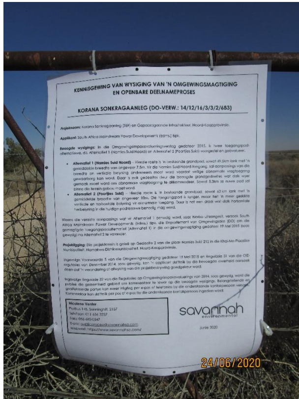
Figure 3: Site Notice placed on the entrance gate to the site along the Namies Suid access road

Co-ordinates: 29°18'11.02"S, 19°12'38.8"E