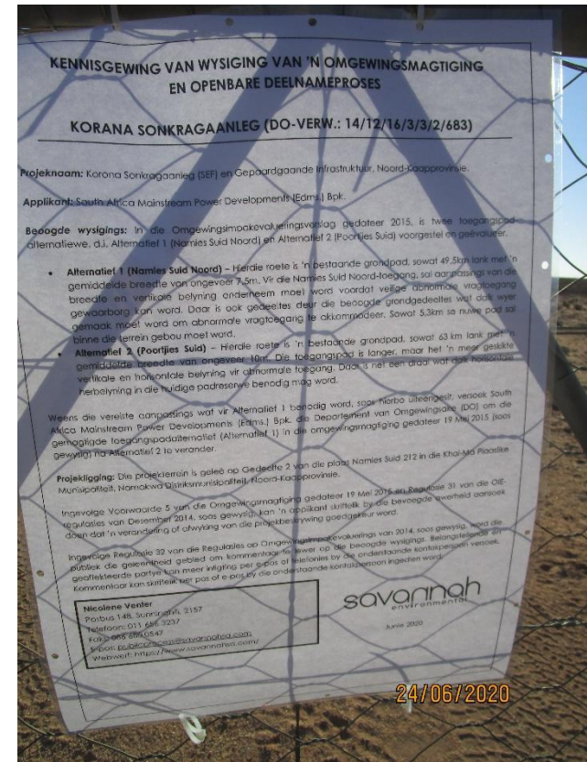
Figure 2: Site Notice placed on the entrance gate to the site along the Poortjies South access road

Co-ordinates: 29°14'48.0"S, 18°53'33.8"E