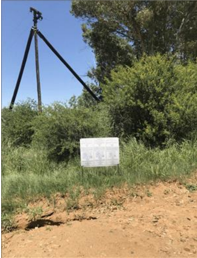
Figure 6: Site notice placed at 27^{\circ}54'45.93''\text{S} , 27^{\circ}9'34.77''\text{E} .