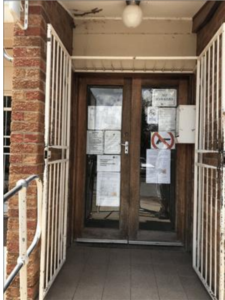
Figure 13: A3 posters (in English Afrikaans and Sesotho) placed at the local clinic.