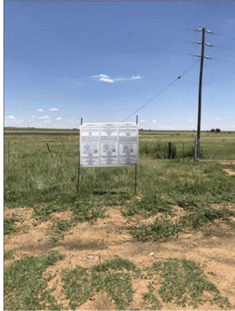
Figure 9: Site notice placed at 27°57'15.06"S, 27°11'29.48"E.