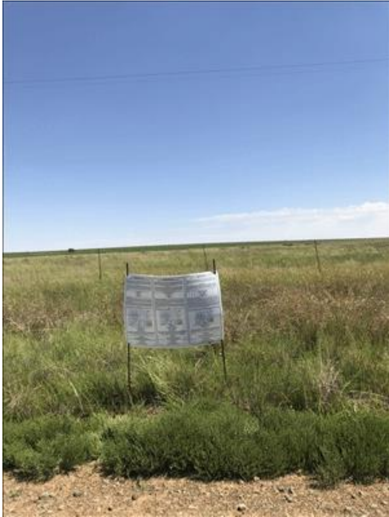
Figure 4: Site notice placed at 27^{\circ}54'13.49''\text{S} , 27^{\circ}11'10.46''\text{E} .