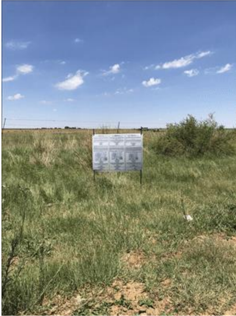
Figure 8: Site notice placed at 27°55'45.18"S, 27°7'45.92"E.