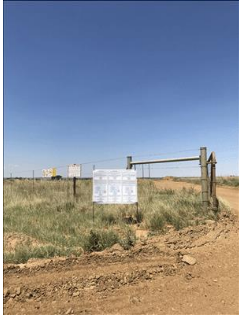
Figure 5: Site notice placed at 27^{\circ}52'50.90''\text{S} , 27^{\circ}12'25.24''\text{E} .