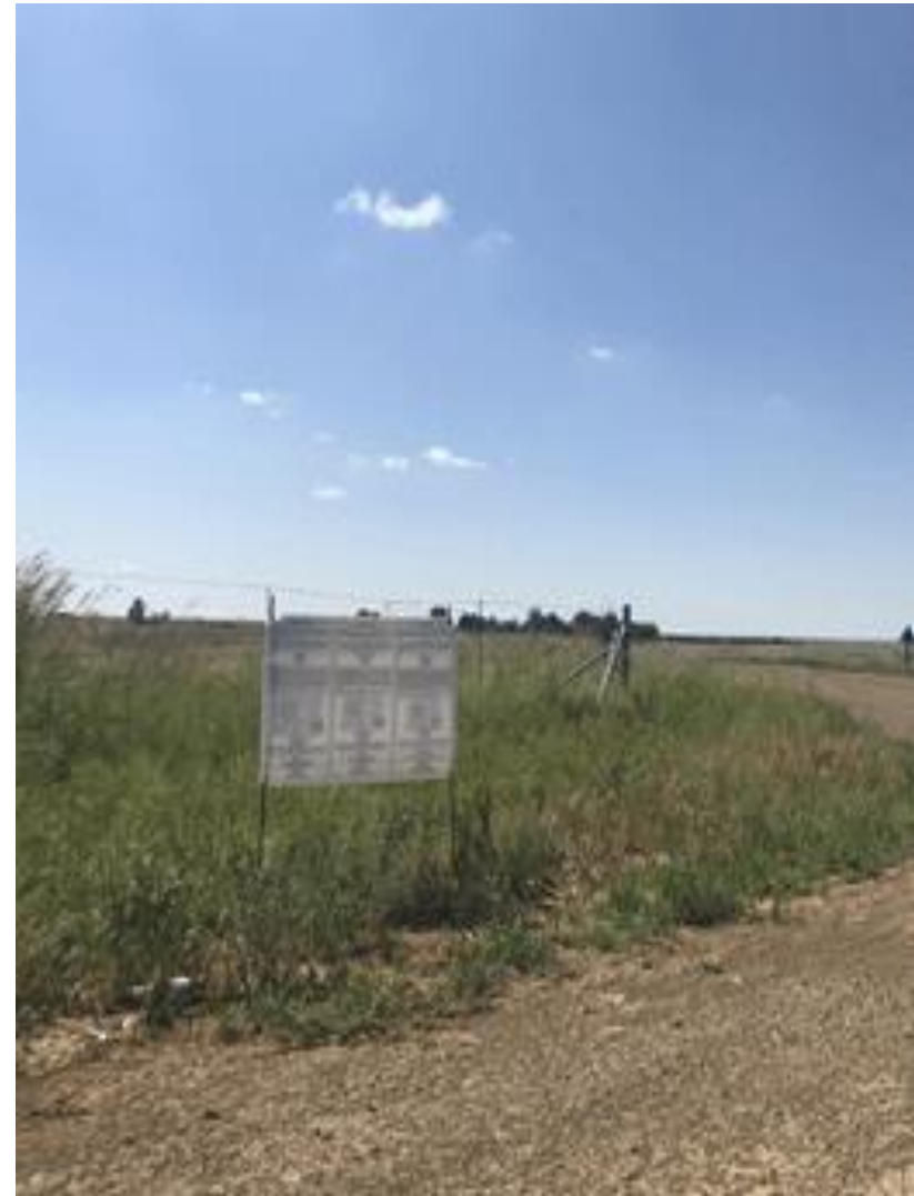
Figure 3: Site notice placed at 27^{\circ}54'59.32''\text{S} , 27^{\circ}12'15.31''\text{E} .