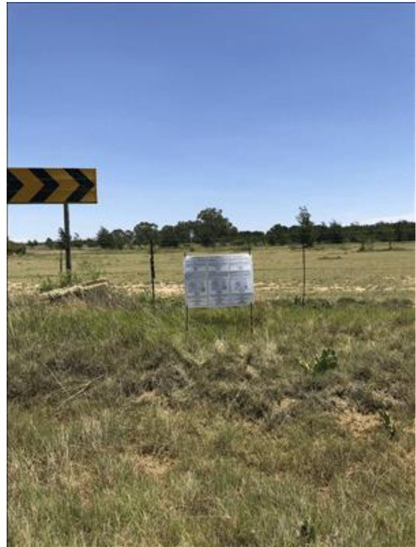
Figure 7: Site notice placed at 27^{\circ}54'48.12''\text{S} , 27^{\circ}7'49.04''\text{E} .