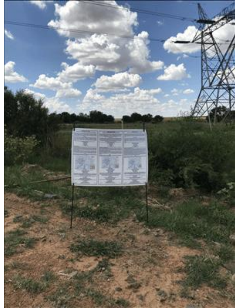
Figure 11: Site notice placed at 28^{\circ}0'9.36''\text{S} , 27^{\circ}10'44.27''\text{E} .