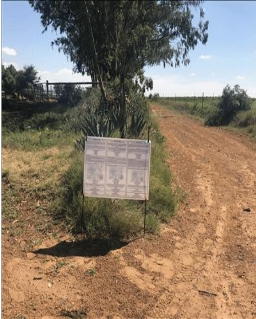
Figure 2: Site notice placed at 27^{\circ}55'55.44''\text{S} , 27^{\circ}13'32.57''\text{E} .