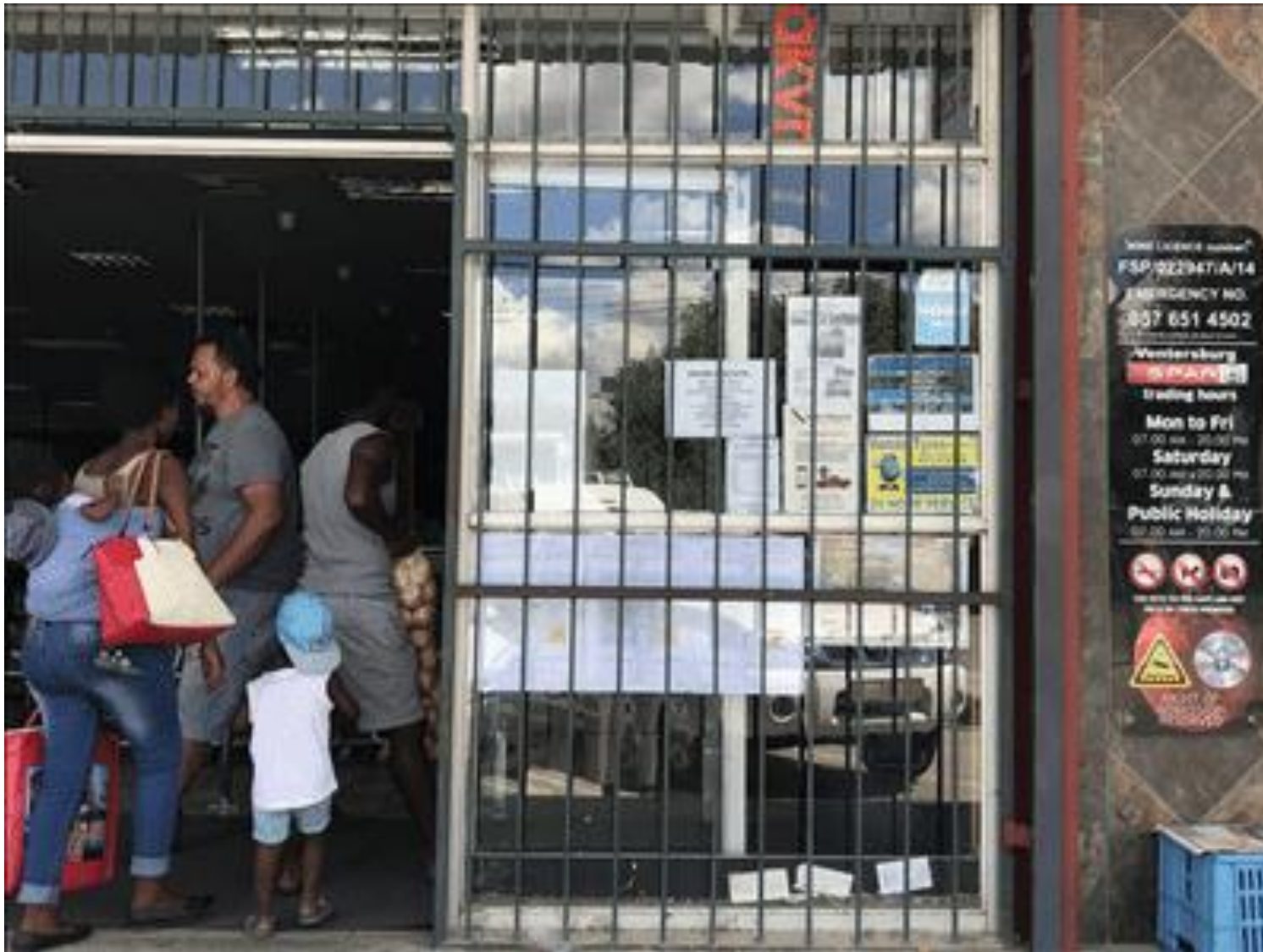
Figure 14: A3 posters (in English, Afrikaans and Sesotho) placed at the local Spar Supermarket.