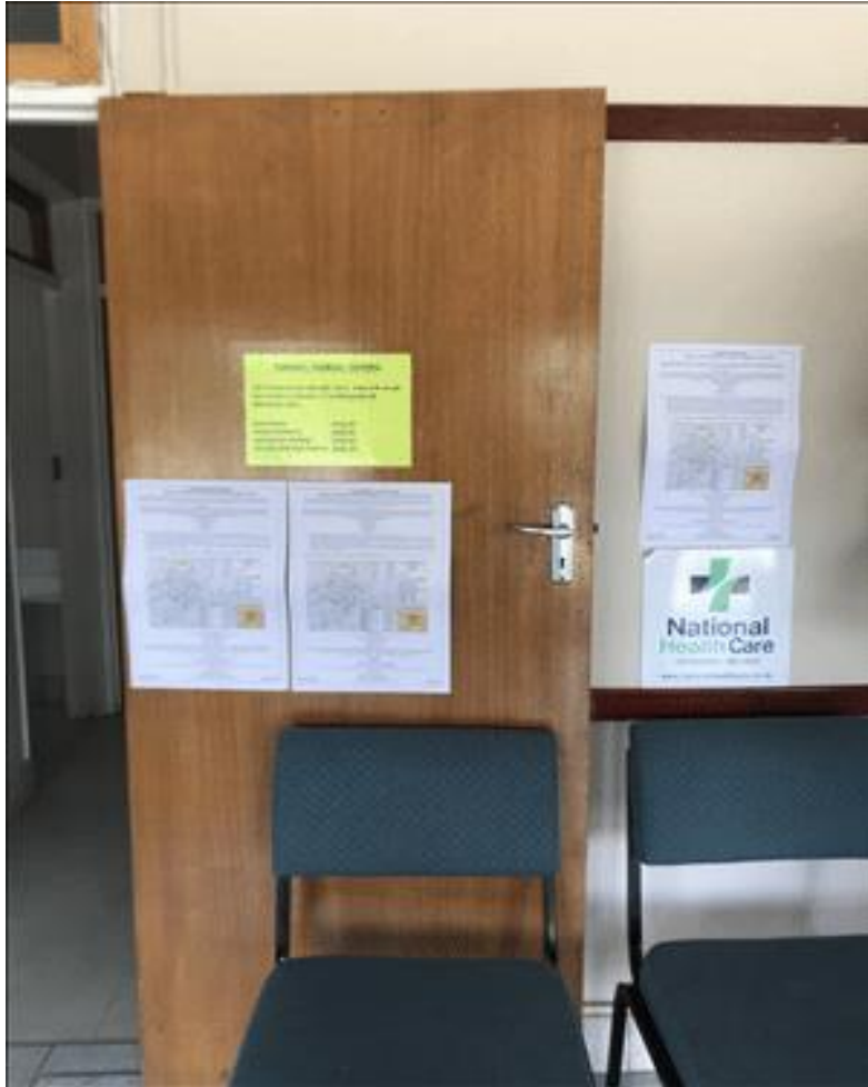
Figure 12: A3 posters (in English, Afrikaans and Sesotho) placed at the Dr Paul Virility Medical Centre.