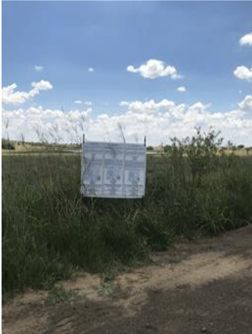
Figure 10: Site notice placed at 27^{\circ}59'3.53''\text{S} , 27^{\circ}8'15.42''\text{E} .