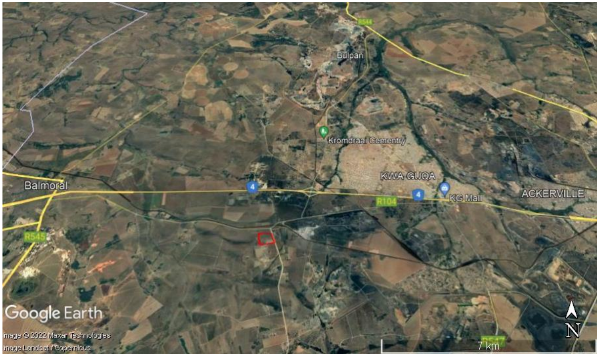
Figure 1: Google Earth map of the general area to show the relative land marks. The cemetery project site is shown by the red rectangle.