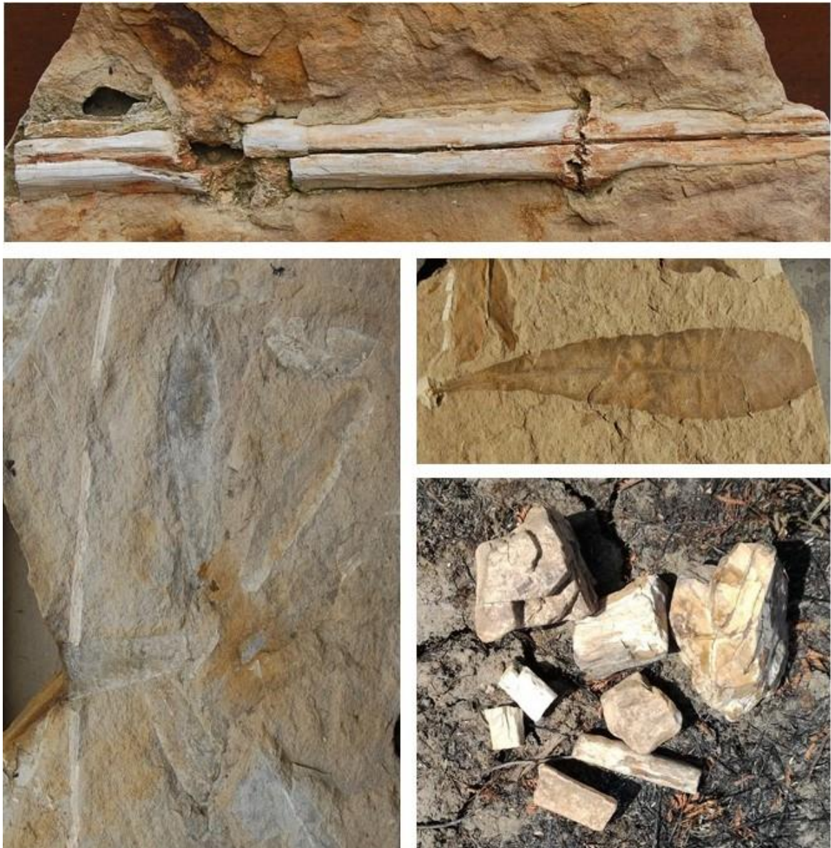
Figure 5: Photographs of fossil plants of the early Glossopteris flora that occur in the Dwyka Group sediments in north western South Africa.