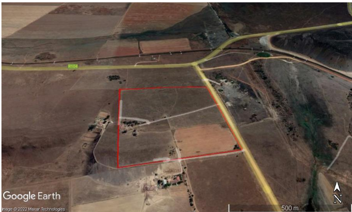
Figure 2: Google Earth Map of the proposed development of the Sukasa Cemetery, west of Witbank with the section shown by the red outline.