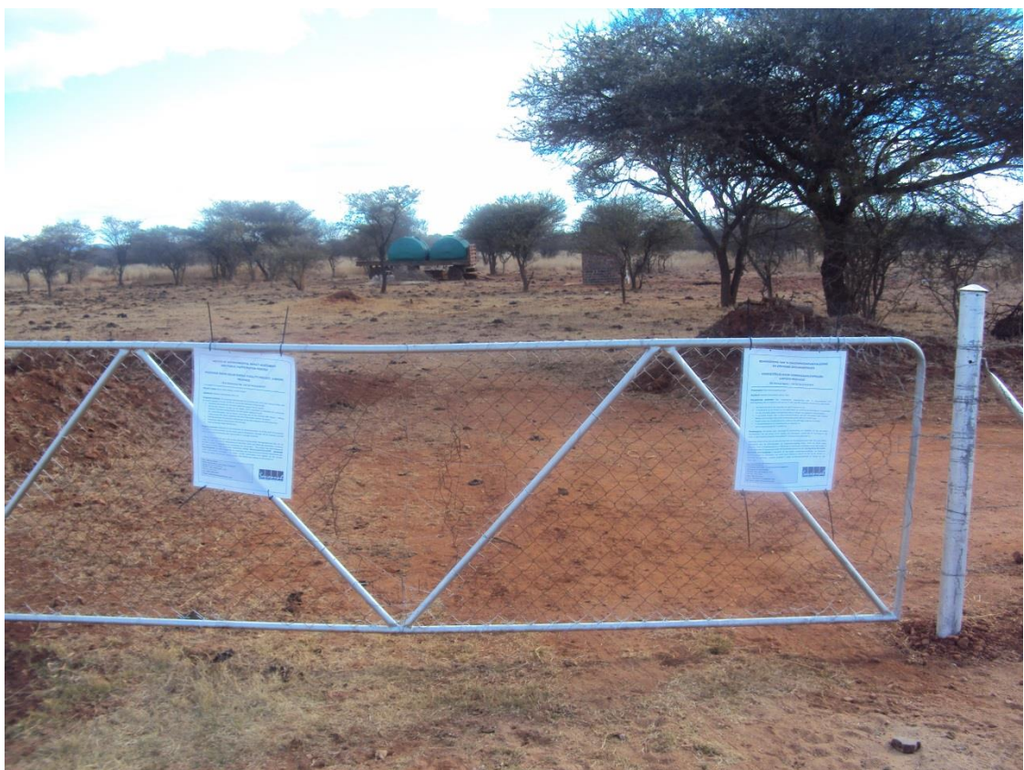
English and Afrikaans site notices placed at entrance gate to site