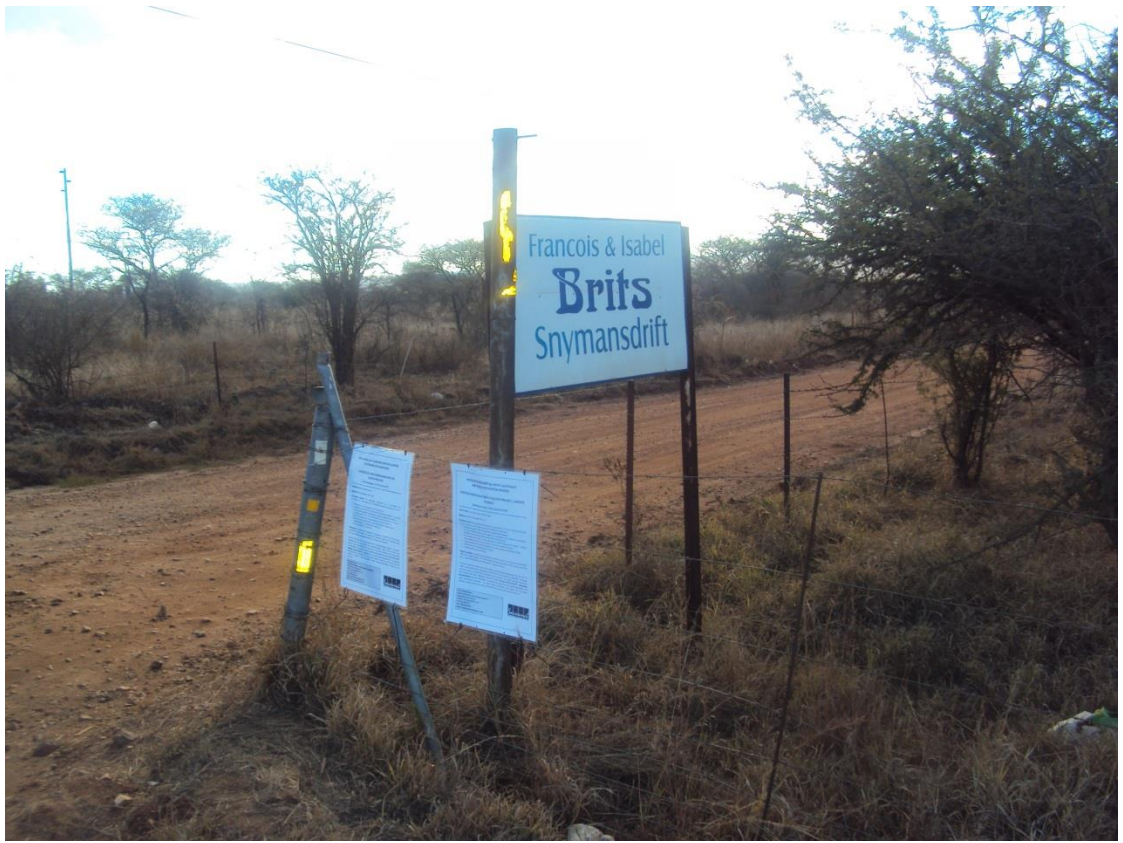
English and Afrikaans site notices placed at the turnoff to the site from the R101