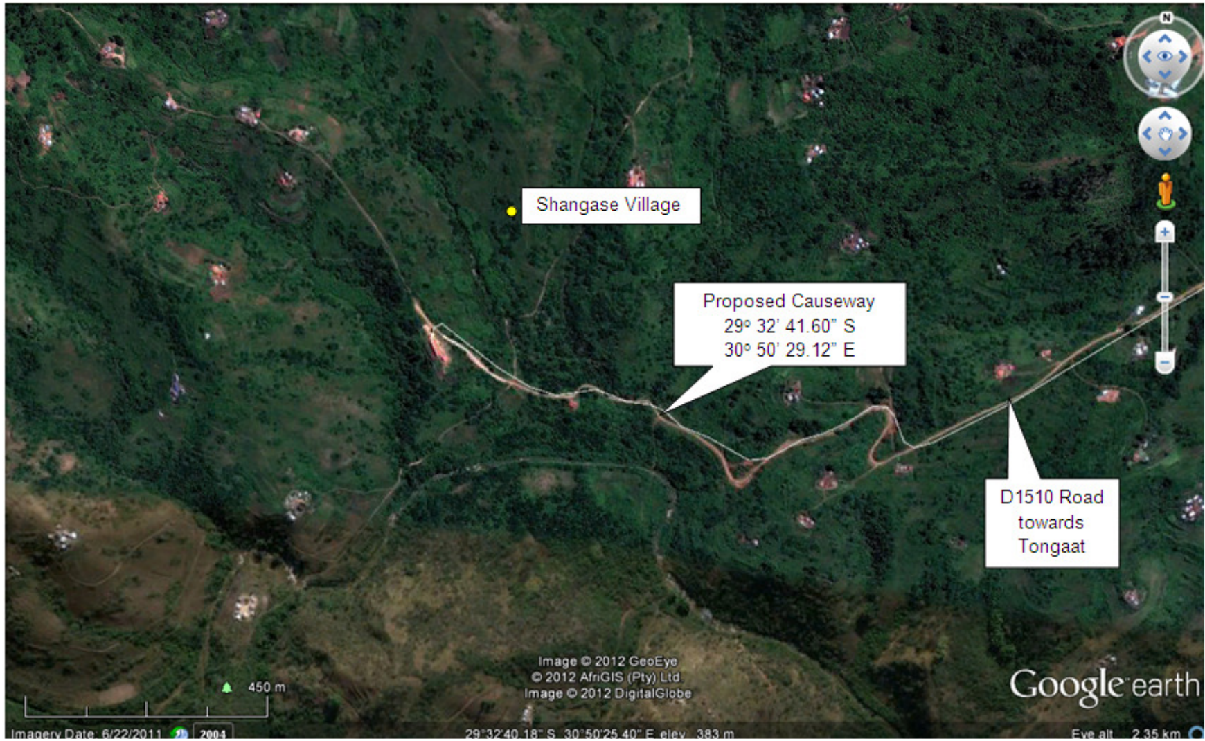
Figure 2: Aerial Map showing the location of the proposed causeway along the D1510 Road and the surrounding land uses (Source: Google Earth).