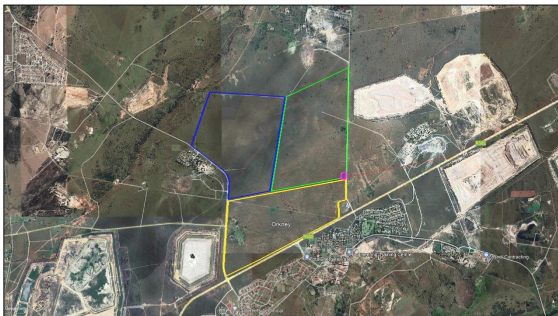
Figure 2: Site and surrounds 2022.