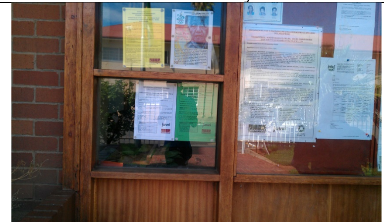
Figure 4: Site notice at the Siyathemba Local Municipality