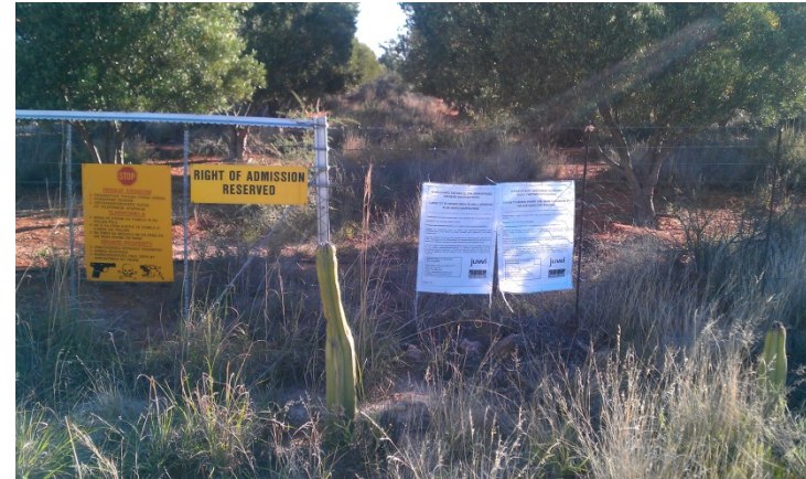
Figure 6: Site Notice at the access road