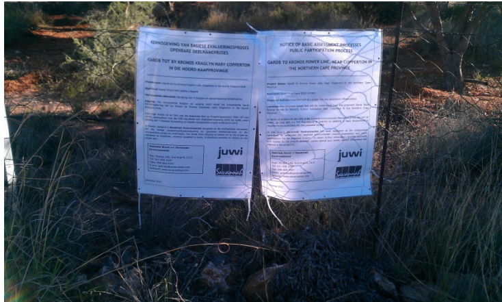
Figure 5: Site Notice at the access road