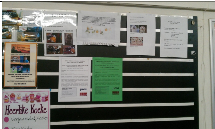
Figure 3: Site notice at the Prieska Spar