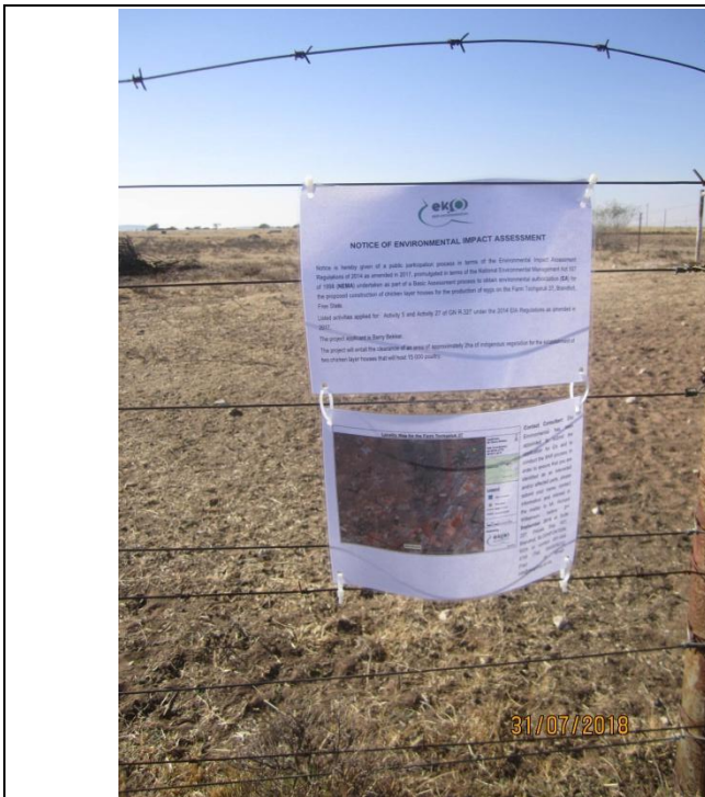
A site notice that was placed at the entrance to the site on the Farm Tochgeluk 37.