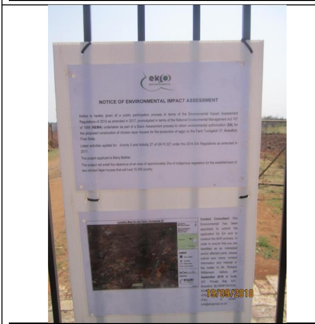
A site notice that was placed at the entrance to the farm on the Farm Tochgeluk 37