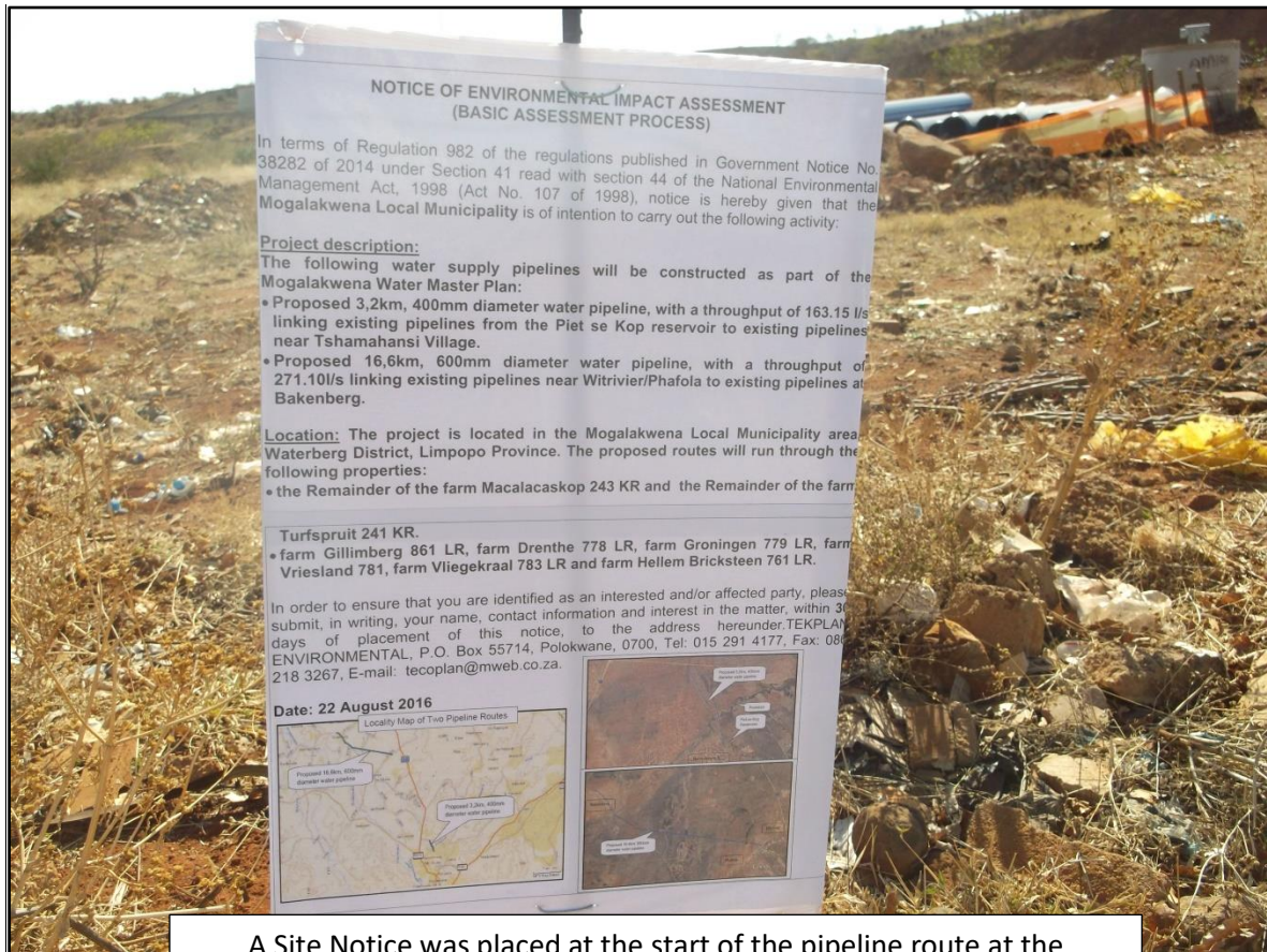
A Site Notice was placed at the start of the pipeline route at the connection point with existing pipelines near the Piet-Se-Kop Reservoir.