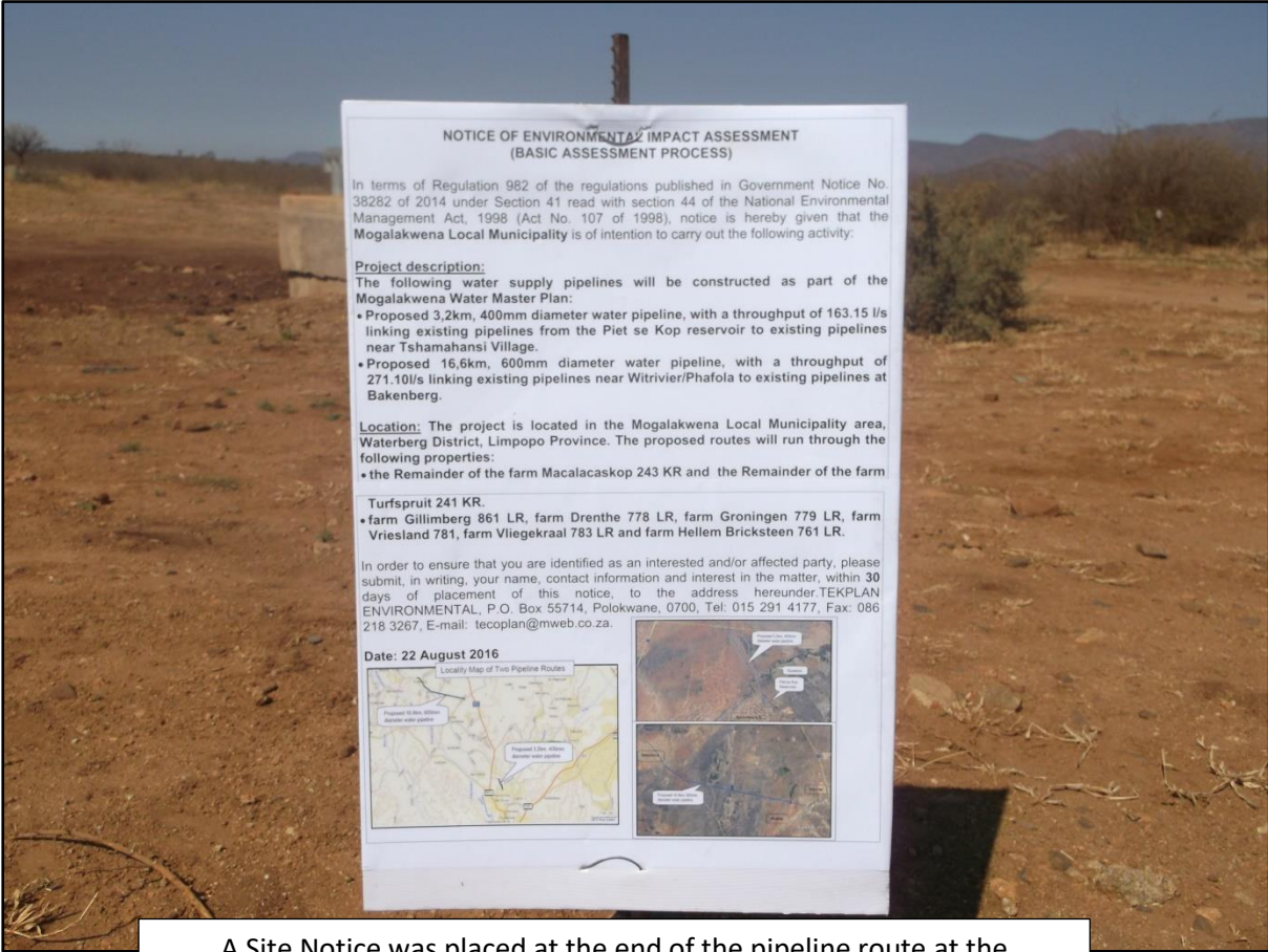
A Site Notice was placed at the end of the pipeline route at the connection point with the existing pipelines near Tshamahansi Village