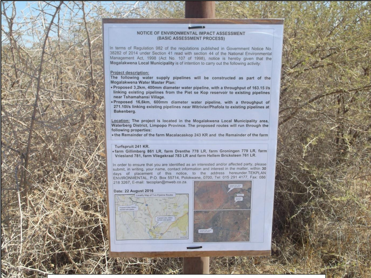
A Site Notice was placed along the pipeline route where it crosses a main gravel road.