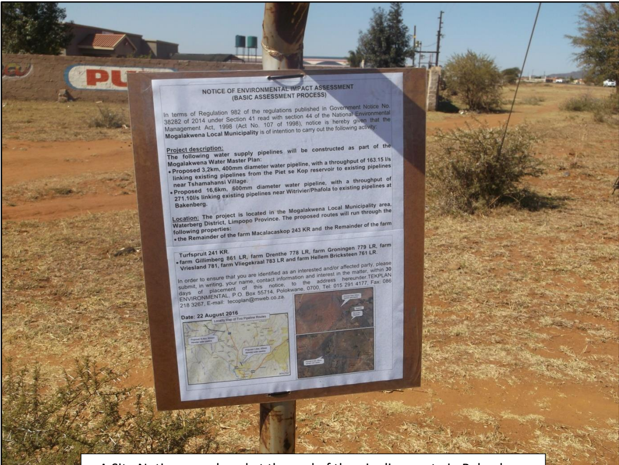
A Site Notice was placed at the end of the pipeline route in Bakenberg