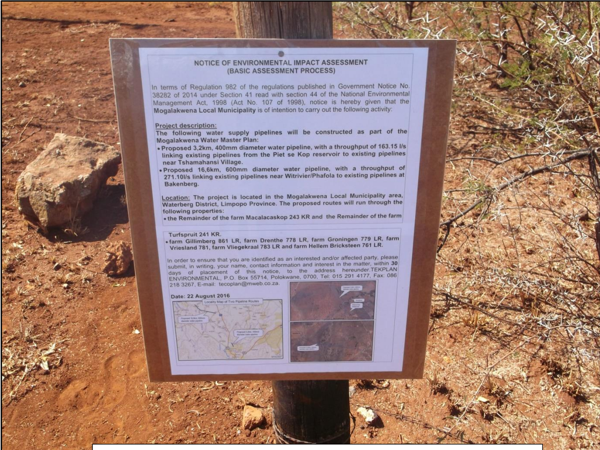
A Site Notice was placed along the pipeline route where it runs adjacent to the main tar road (D4380) to Bakenberg.