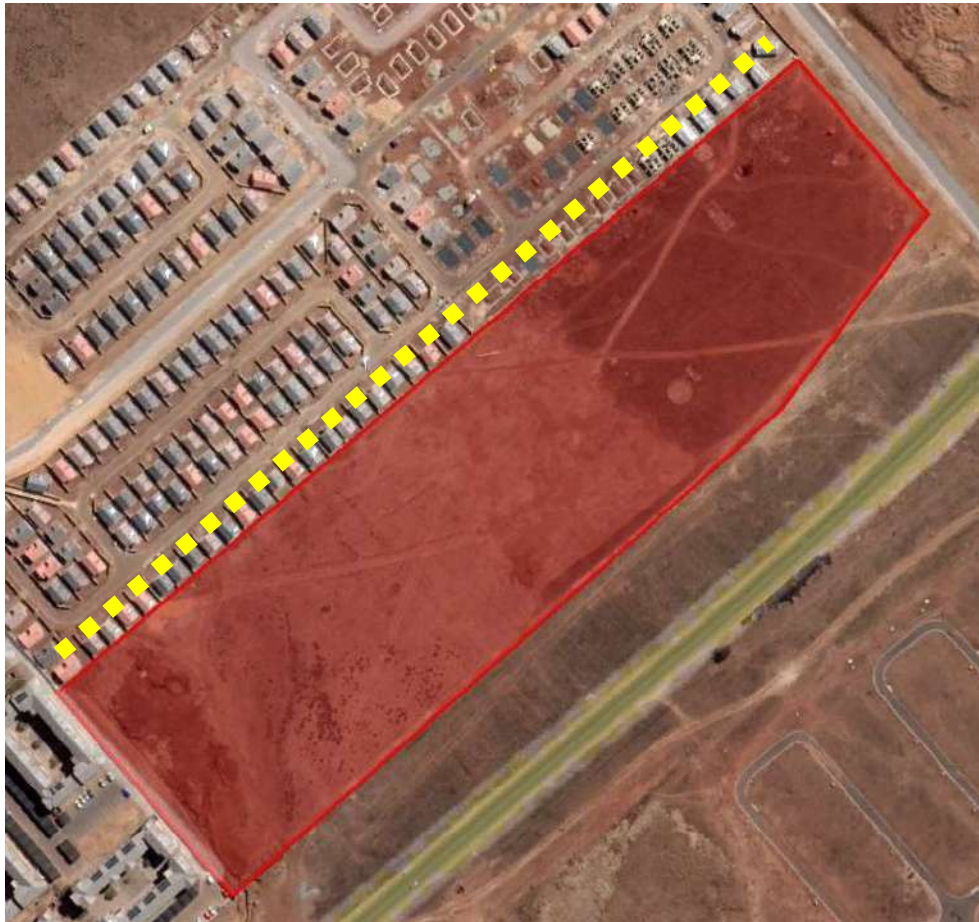
42 Letters were hand delivered as indicated on the photo above in yellow.