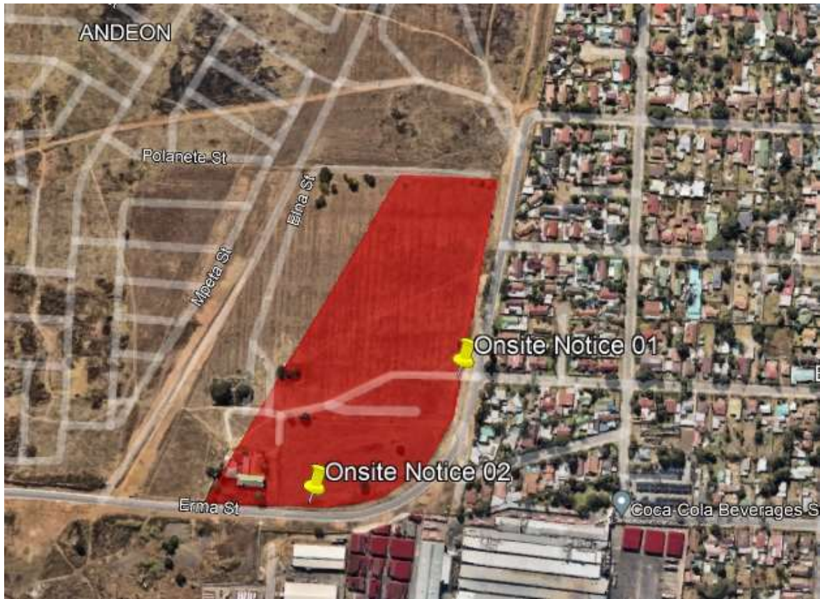
Onsite Notice 01: Placed at existing entrance gate of property