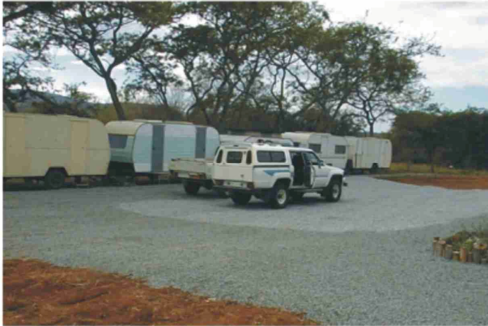
Figure 2: Example of construction camps