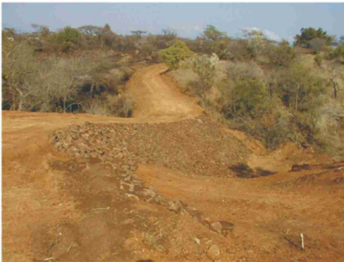
Example of bush clearing