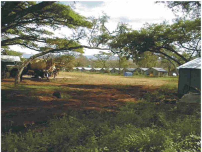
Example of a construction camp