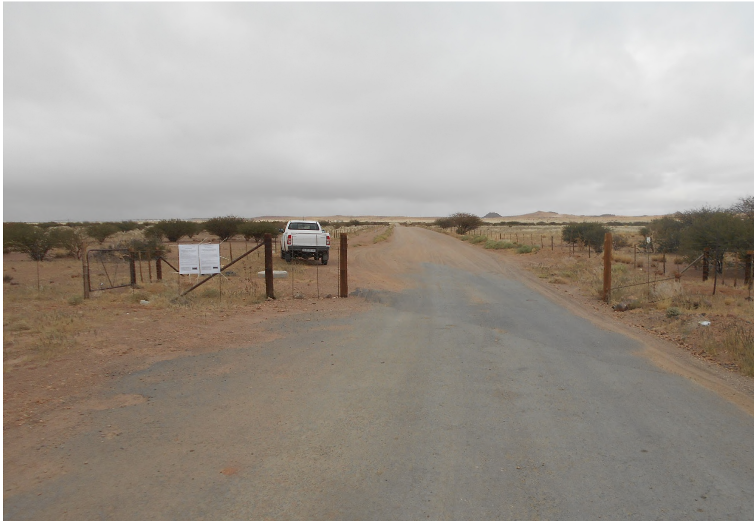
Figure 1: Site notices placed at intersection between the MN73 and the R357 (Onseepkans road). Coordinates; S 28° 50' 56.12"; E 19° 34' 54.08"