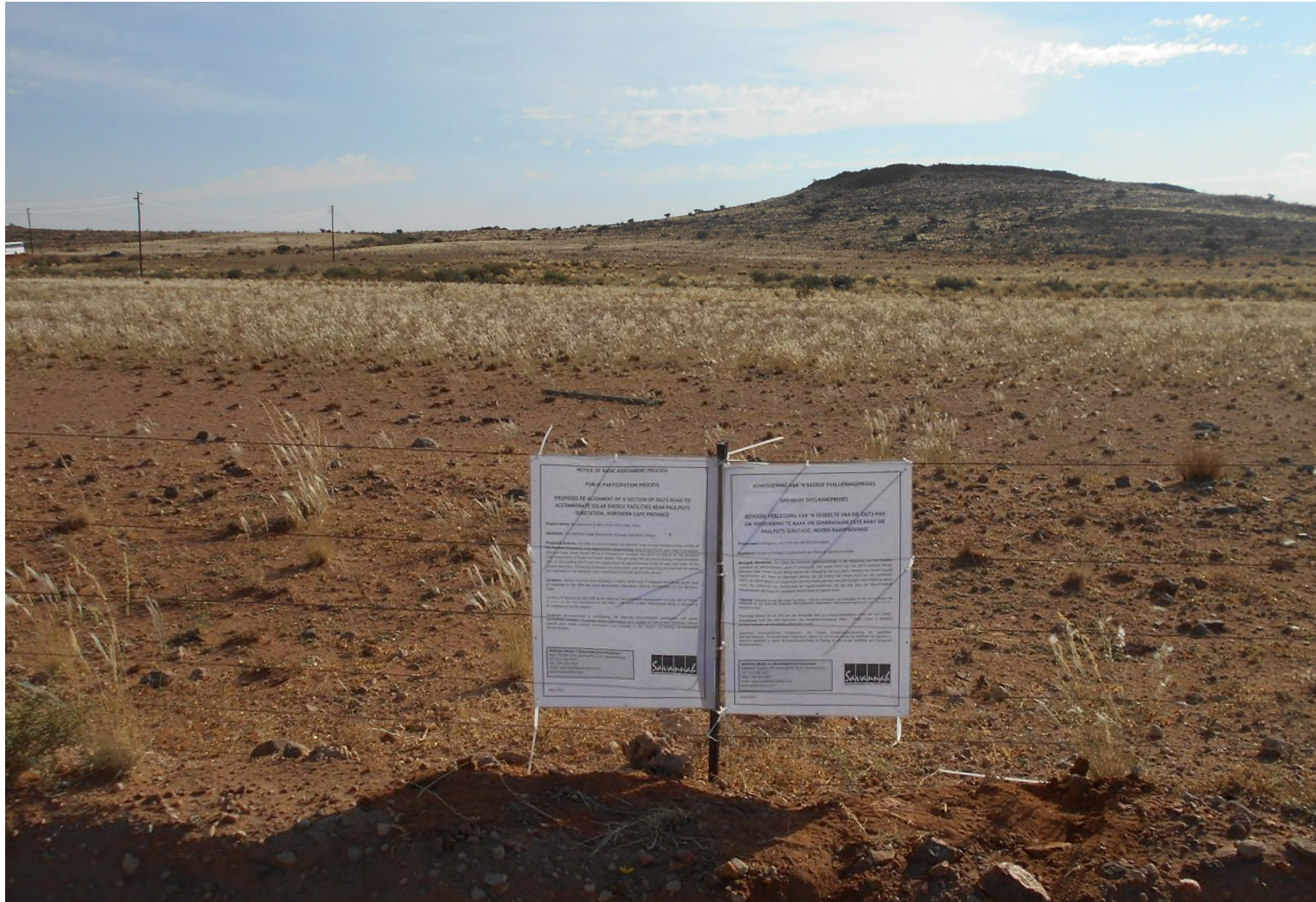
Figure 2: Site notices placed along the MN73. Coordinates; S 28° 52 ' 29.88'' ; E 19° 34 ' 01.76''