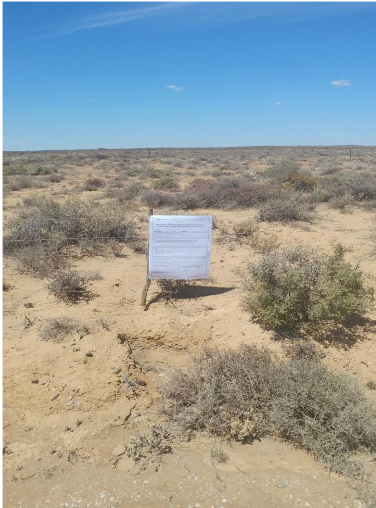
Figure 2: English site notice placed on a boundary fence along the existing dirt access road – Granaatboskolk Road Co-ordinates: 30°57'11.42"S; 19°26'19.46"E