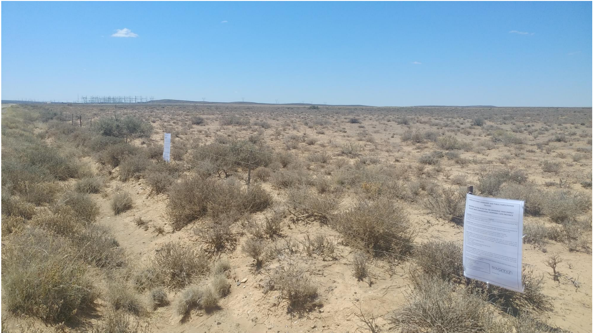
Figure 1: Site notices (Afrikaans and English) placed on a boundary fence along the existing dirt access road – Granaatboskolk Road, near the existing Helios Substation (30°30'21.78"S; 19°33'24.05"E).