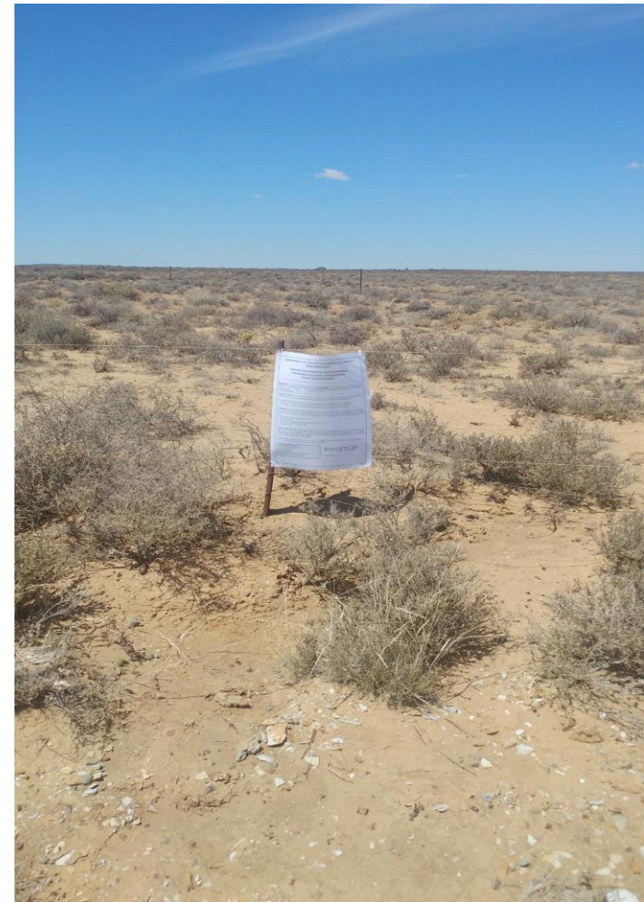
Figure 3: Afrikaans site notice placed on a boundary fence along the existing dirt access road – Granaatboskolk Road Co-ordinates: 30°57'11.42"S; 19°26'19.46"E