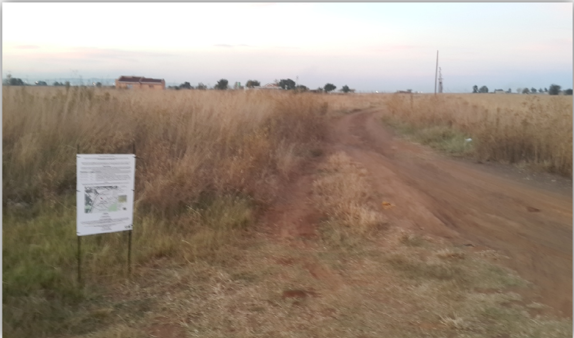
Figure 2: Site notice 2 GPS co-ordinates: -26.568768°S 27.869133°E