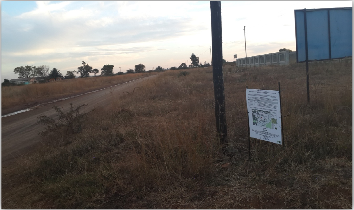
Figure 1: Site notice 1 GPS co-ordinates: -26.568699°S 27.868908°E