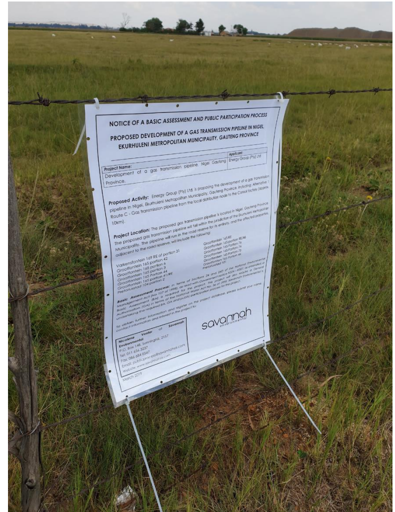
Site Notice 2: Site Notice place on farm fence along the Dunnottar Road (M45)

Co-ordinates: 26°21'11.80"S; 28°26'51.27"E