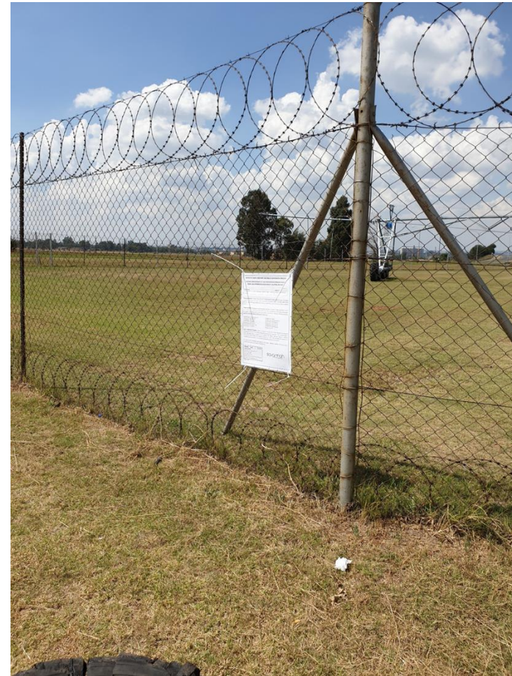
Site Notice 1: Site Notice placed on the corner of Nigel/Dunnottar Road (M63) and Visagie Road, on the property fence of Value Logistics

Co-ordinates: 26°24'49.78"S; 28°26'48.40"E