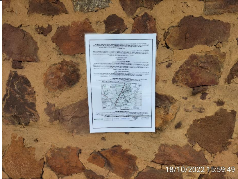
Figure 5: Hokaai Padstal, along the R25 zoomed in