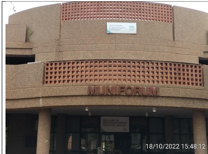
Figure 7: City of Tshwane Municipality (Bronkhorstspuit)