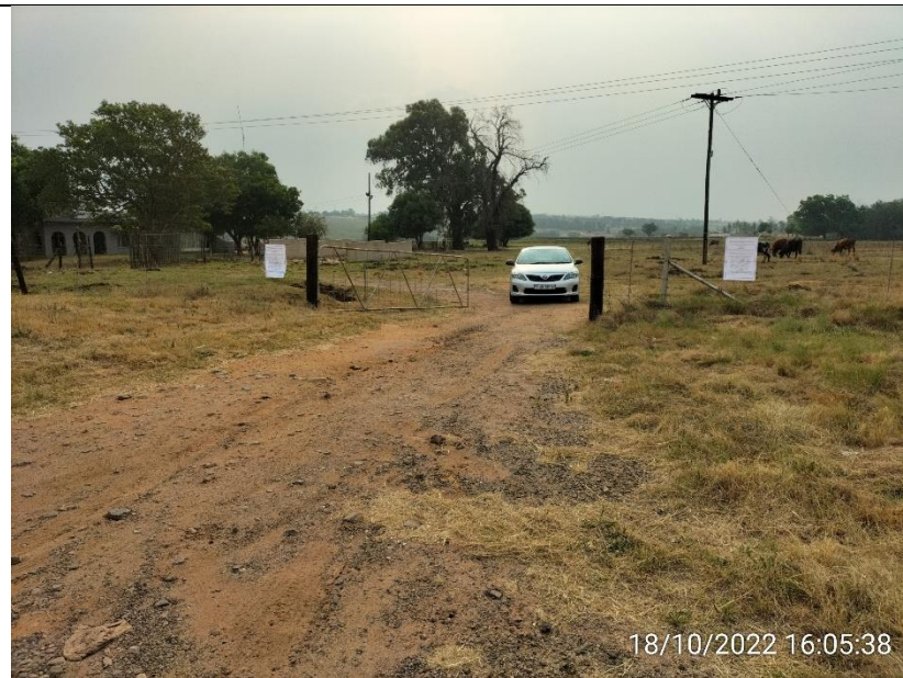
Figure 3: On the fence of the proposed site