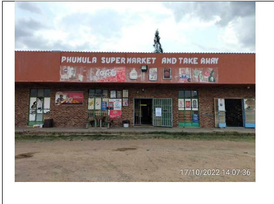
Figure 1: Phumula Supermarket and Take Away