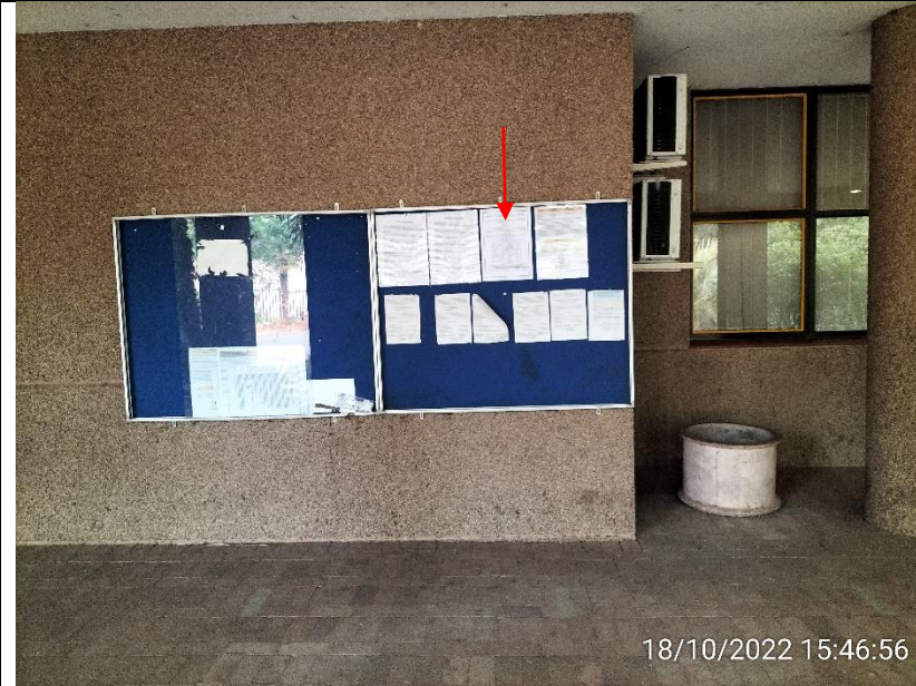
Figure 6: City of Tshwane Municipality (Bronkhorstspuit)