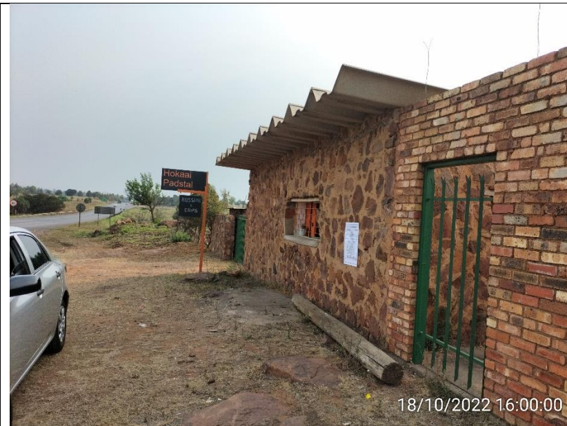
Figure 4: Hokaai Padstal, along the R25