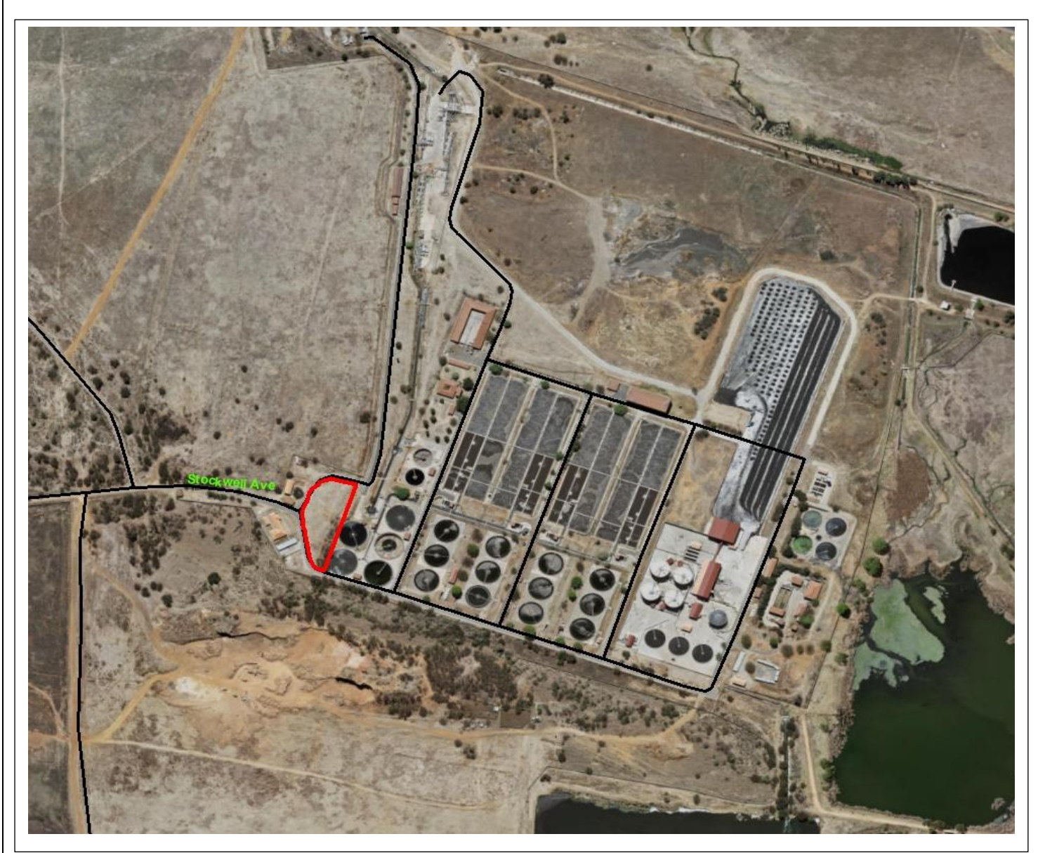
and commenting on the project in the following way: