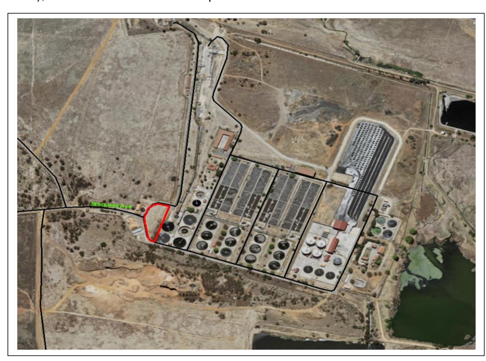
Figure 1: Location of the Bushkoppie WwTW

The proposed development will trigger the requirement of a Basic Assessment process to be undertaken in terms of Listing Notice 1 (GN. R983) and Listing Notice 3 (GN. R985), as amended, of the EIA Regulations 2014, as amended. A Water Use License (WULA) in terms of section Section 21 of the National Water Act (NWA) (36 of 1998), as amended will also be required.