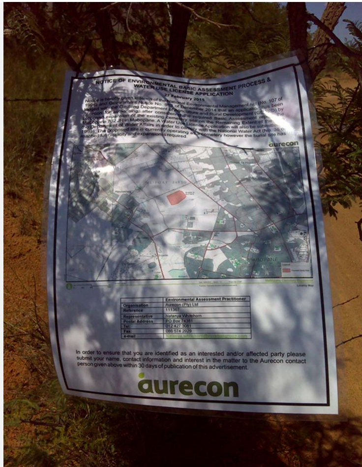
Figure 1: Mabopane Cemetery