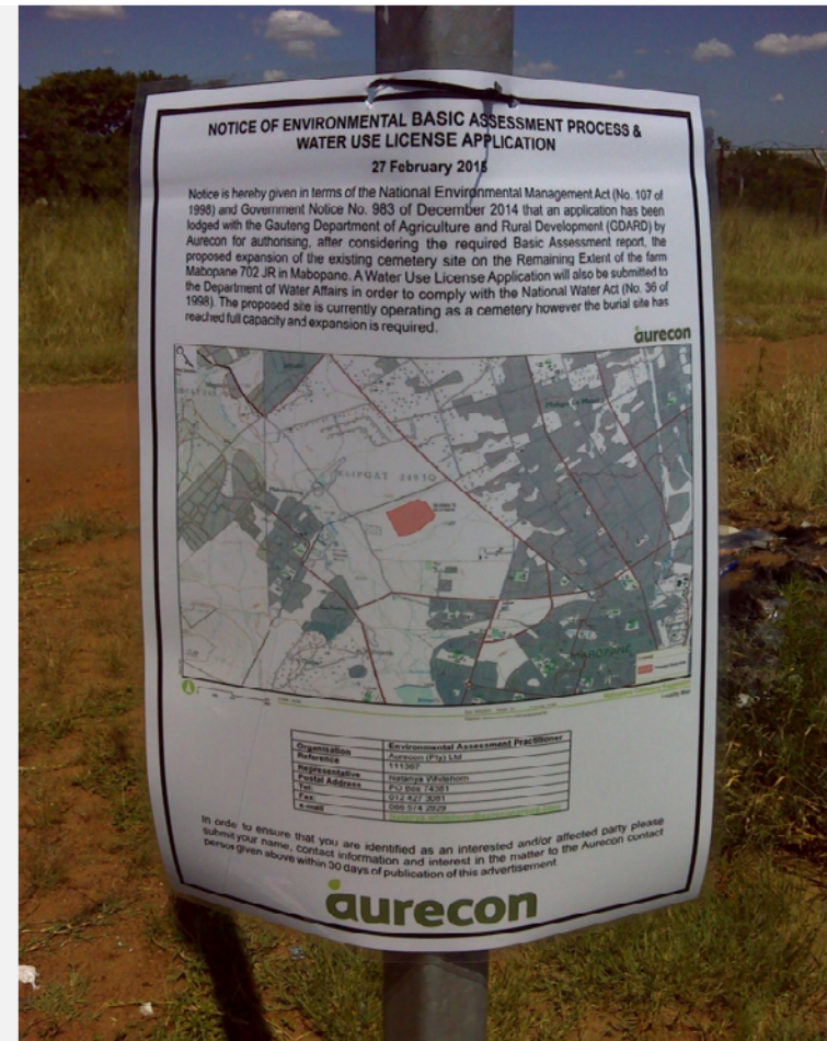
Figure 2: Bus stop