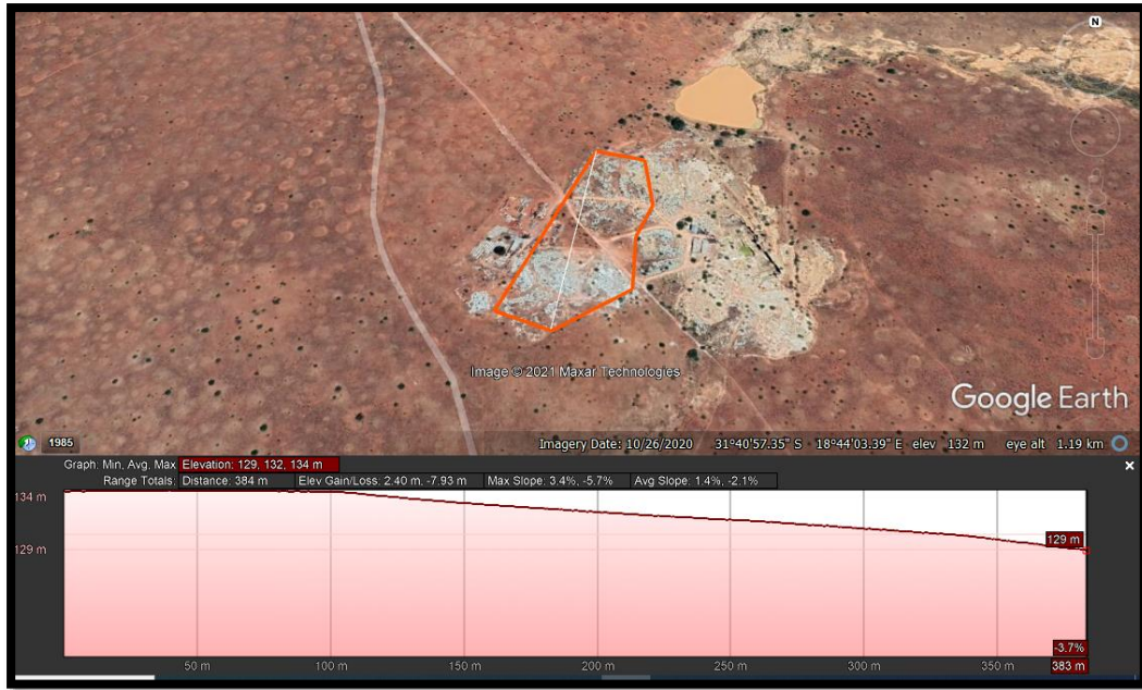
Figure 2: Elevation profile of the proposed mining footprint.