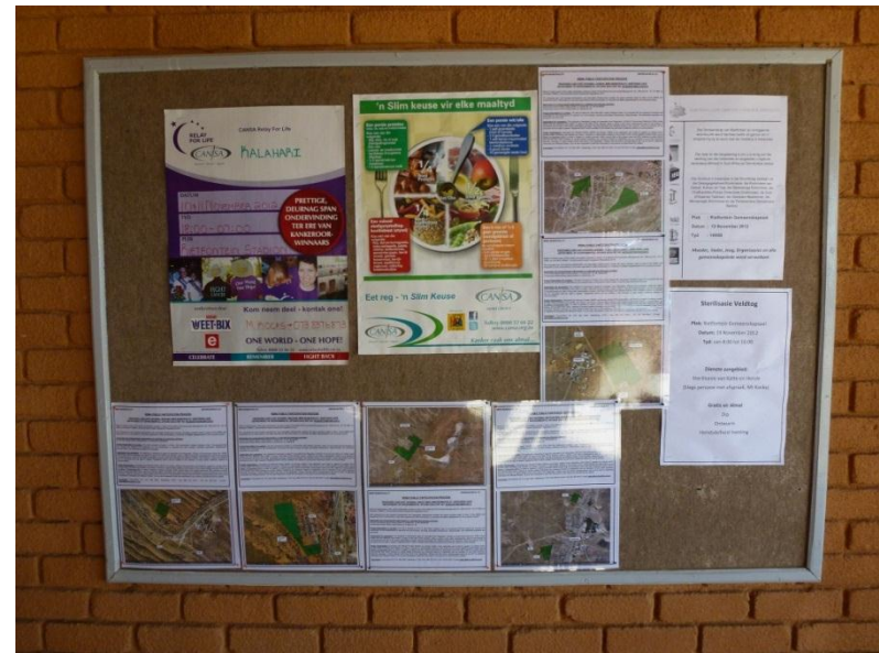
Poster placed at the Municipal offices notice board in Rietfontein