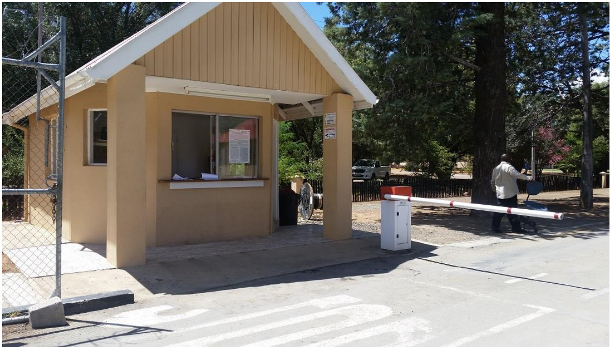
Poster placed on the entrance of the Grootfontein Agricultural Development Institute.