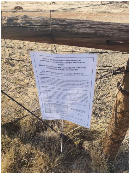
Site Notice: placed close to the R12 and next to the development area (29° 19' 57.61"S; 24° 25' 33.015"E)