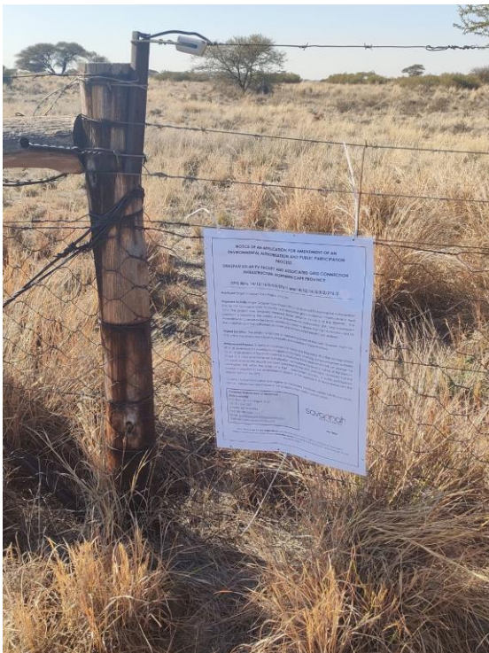
Site Notice: placed near the entrance to the development area (29° 20' 7.029"S; 24° 25' 49.577"E)