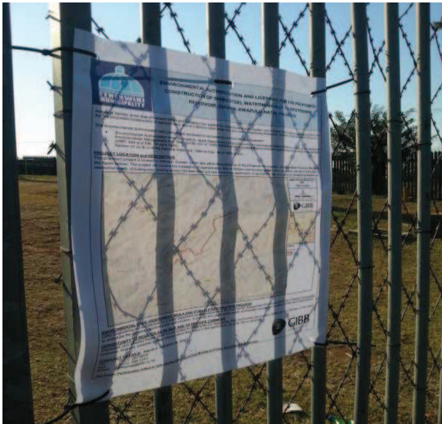
End point of the proposed pipeline route. Showing the site notice placed at the Westriding Reservoir.