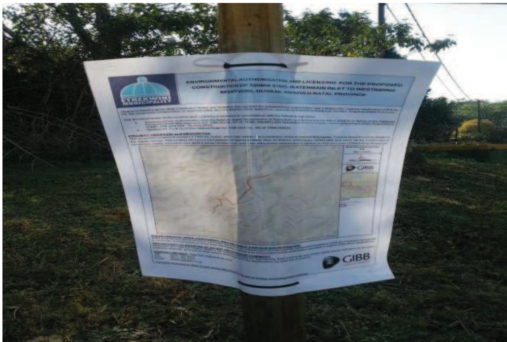
Showing the site notice placed on the corner of Assagay Road and Gevers Road.