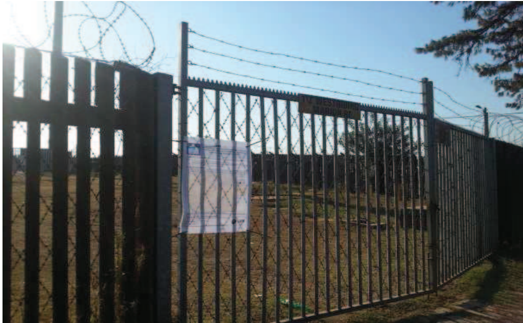
End point of the proposed pipeline route. Showing the site notice placed at the Westriding Reservoir.