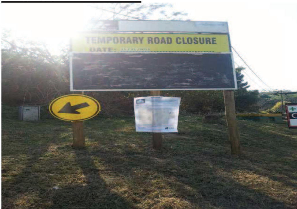
Start point of the proposed pipeline route. Showing the Site Notice placed on the corner of Assagay Road and Gevers Road.