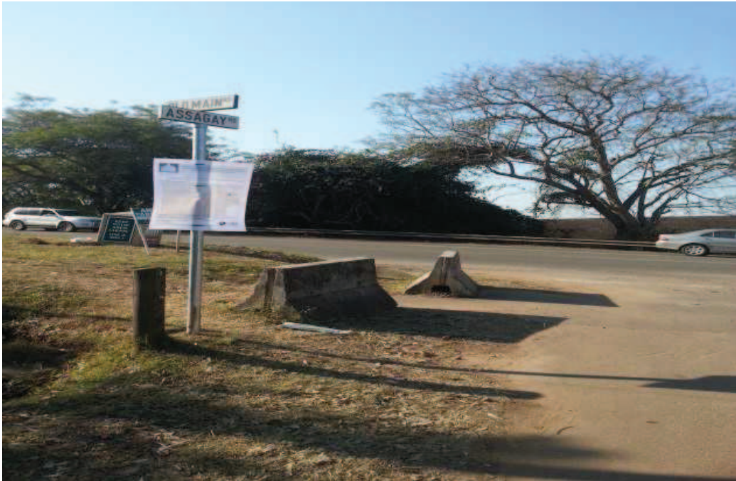
Middle point of the proposed pipeline route. Showing the site notice placed on the corner of Assagay road and Old Main Road.