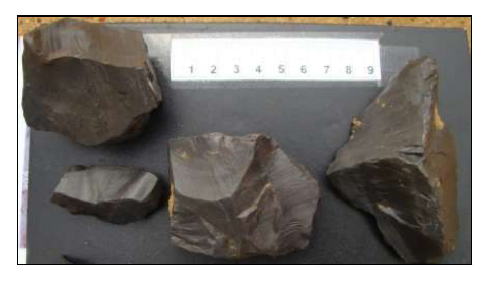
Figure 15: Four artefacts found at 001.

Four of the pieces are irregular cores, there is a chunk with some notching, and a single flake with retouch along its margin. It is not possible to clearly identify these artefacts to a single stone industry. The location of the small scatter of stone tools, in close proximity to the stockpile of BIF, and the widespread distribution of BIF along the R31, suggests that the artefacts have been introduced to the site by mining companies from elsewhere. They have clearly not been flaked in situ.