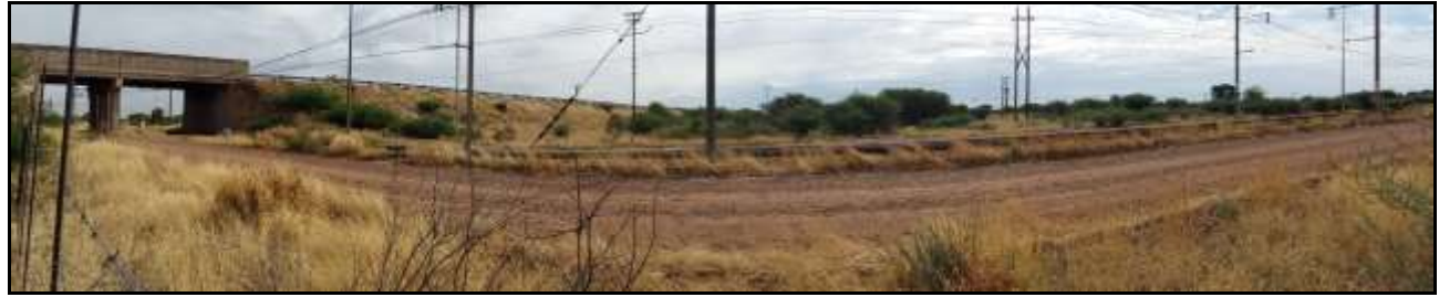
Figure 7: The western half of the farm York A 279 has been bisected by the railway line to Hotazel. The R31 crosses the railway line over the bridge shown to the left, and then travels northward, following the railway line.