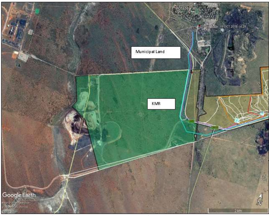
Figure 17: The route of the proposed 132 kV powerline, from York A 279, across the railway line and R31, through the property of KMR and Municipal land, connecting with the Hotazel substation, a distance of 6km in total. Our tracks are shown in white.

The proposed 132 kV powerline which will connect the onsite Substation A or Substation B with the substation at Hotazel, represented in Figure 17 by the purple line, will run in parallel with an existing 132 kV Eskom line (represented by the blue line). A foot survey (shown in white) was conducted along the route of the proposed line as far as the railway line. The survey along that portion of the line which runs through land belonging to Kudumane Mineral Resources (KMR) was conducted in a mine vehicle, as explained above, due to mine safety considerations.