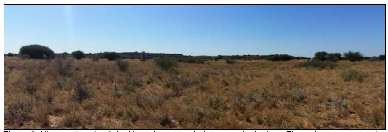
Figure 9 : View northwards of the Hotazel waste rock dumps on the horizon. These dumps separate the proposed PV facility from the town of Hotazel.