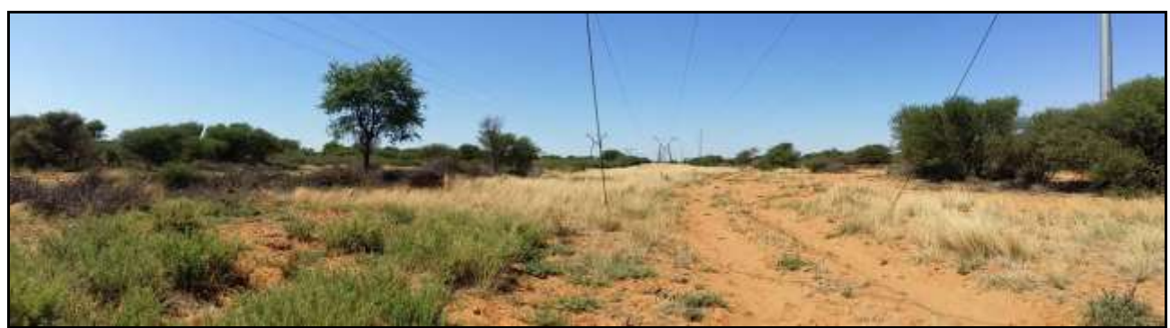
Figure 10: View in a southerly direction of the OHL crossing the eastern edge of Portion 11 of York A 279, belonging to KMR. The proposed 132kV line will run in parallel with these existing lines.