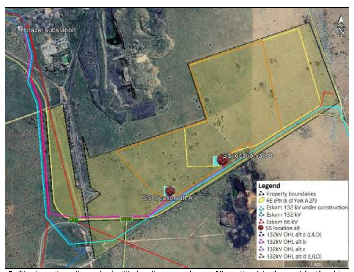
Figure 3: The two alternative solar facility locations are shown: Alternative 1 to the east (outlined in yellow) and Alternative 2, the preferred site, outlined in orange. The location of the two alternative on-site substations are shown as Alt A and Alt B. Alternative B is the preferred option. The proposed 132kV powerline from the solar facility will cross Portion 11 of York A 279 owned by Kudumane Mineral Resources and then run through the Remainder of the farm Hotazel 280 belonging to the Hotazel Municipality.