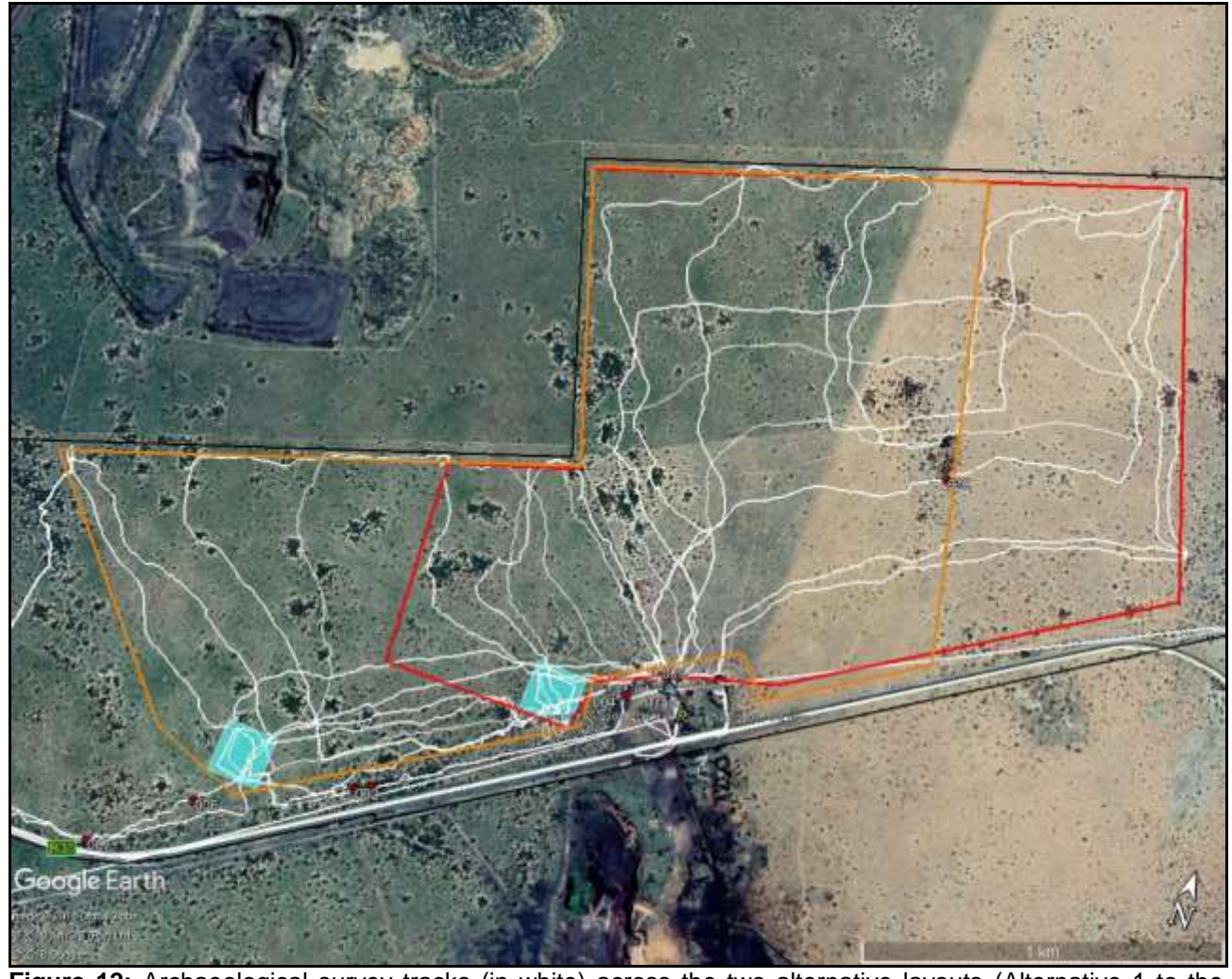
Figure 12: Archaeological survey tracks (in white) across the two alternative layouts (Alternative 1 to the east and outlined in red, Alternative 2 to the west and outlined in orange) on the Remainder of York A 279. The on-site substations are shown in turquoise. Note that the sites identified, represented as red dots, occur along the southern boundary of the site, close to the R31.