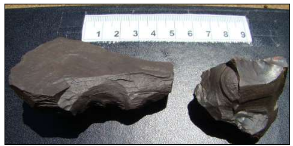
Figure 16: Two artefacts from 009.