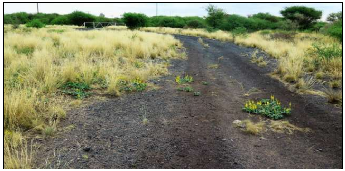
Figure 14: The BIF used to line the Eskom servitude road across the property. It litters the southern section of the study area, along the R31 and the railway line too.

Site 001/009: A total of six (6) stone artefacts were identified in two clusters, in loose aeolian sands, on the track between the farmhouse of York and the worker's cottage. According to John Almond (see Palaeontology Desktop Study) the artefacts are "most likely to be a Precambrian iron ore of some sort and may be derived from a BIF outcrop area. They have a yellowish-brown streak (like goethite, but unlike haematite - the iron ore most commonly associated with BIF) and they are not themselves finely-banded".