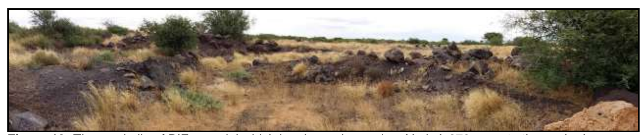
Figure 13: The stockpile of BIF material which has been dumped on York A 279, near to the worker's cottage.

The survey identified a spread of black, iron rich material lying above the red aeolian sands along the R31 road, and under the existing 132 kV and 66 kV powerlines which run along the road (Figure 14). The origins of the material were initially unknown, until Ms Tshifhiwa Nemakhavhani of Kudumane Mineral Resources identified the material as Banded Ironstone Formation or BIF. She explained that the material, together with thick calcrete deposits which overly the manganese in the mining areas, are removed and stored on spoil heaps. Both the calcrete and BIF are used as a base for the construction of roads and the railway line in the area. The stockpile of BIF on York A 279 was dumped there by KMR and is not related to any mining or quarrying on the site (Figure 13).