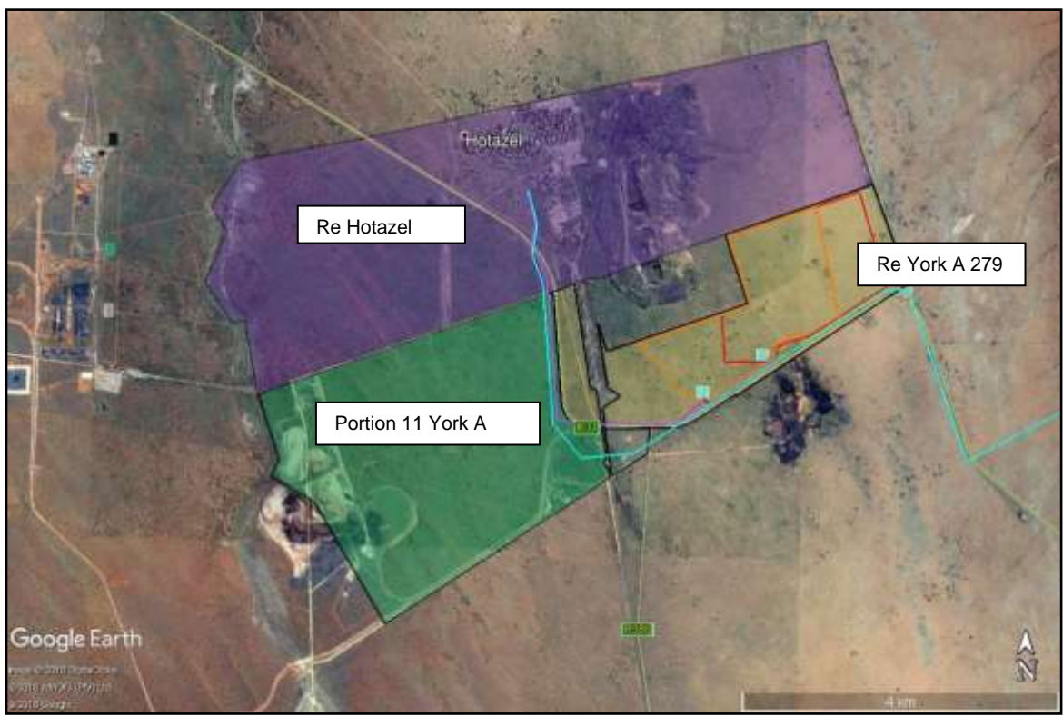
Figure 2: An aerial image of the farm portions which will be crossed by the proposed 132kV powerline from the proposed PV facility to Hotazel substation in the Northern Cape Province.