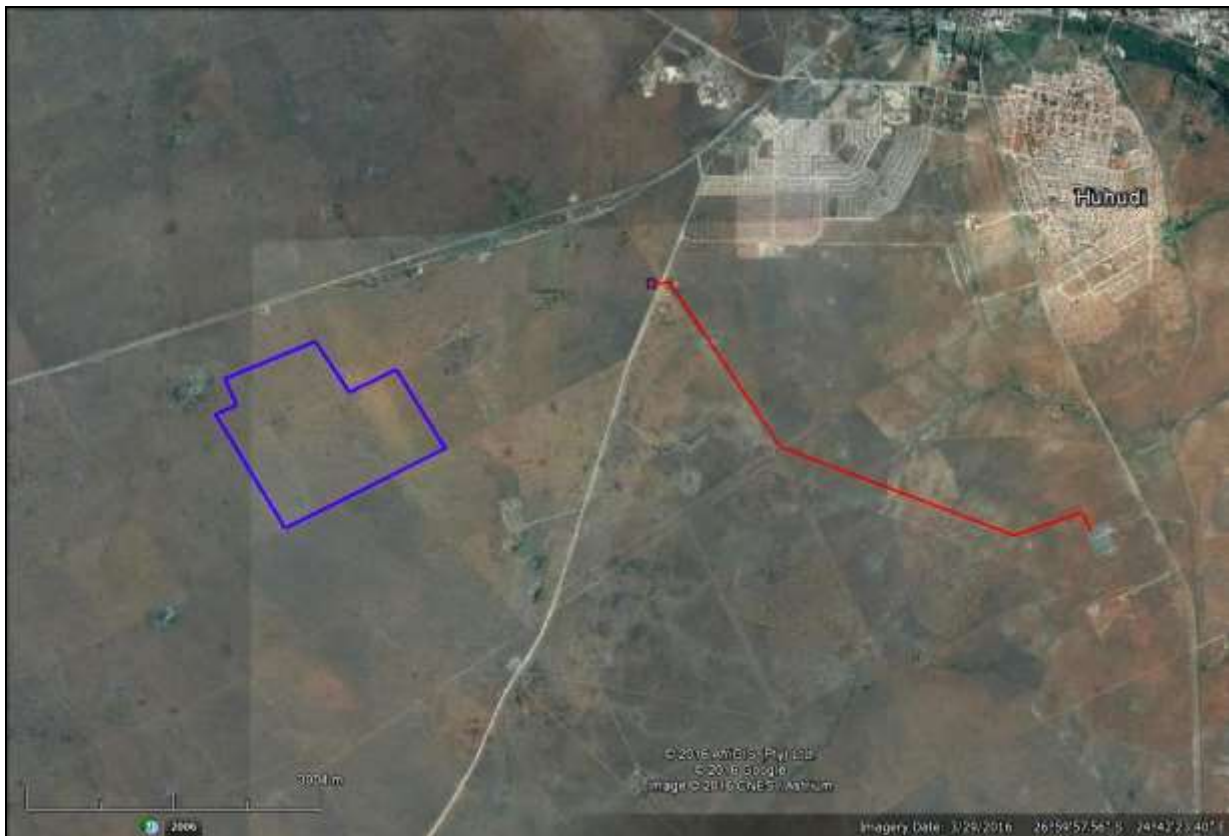
Figure 2: Google earth© satellite image showing the location of the proposed AMDA Echo Solar PV Development in flat terrain on the south-western outskirts of Vryburg, Northwest Province (purple polygon). The red line shows the route for the proposed 132 kV transmission line connecting the solar projects on farm Klondike 670-IN to the existing Mookodi Substation south of Vryburg.