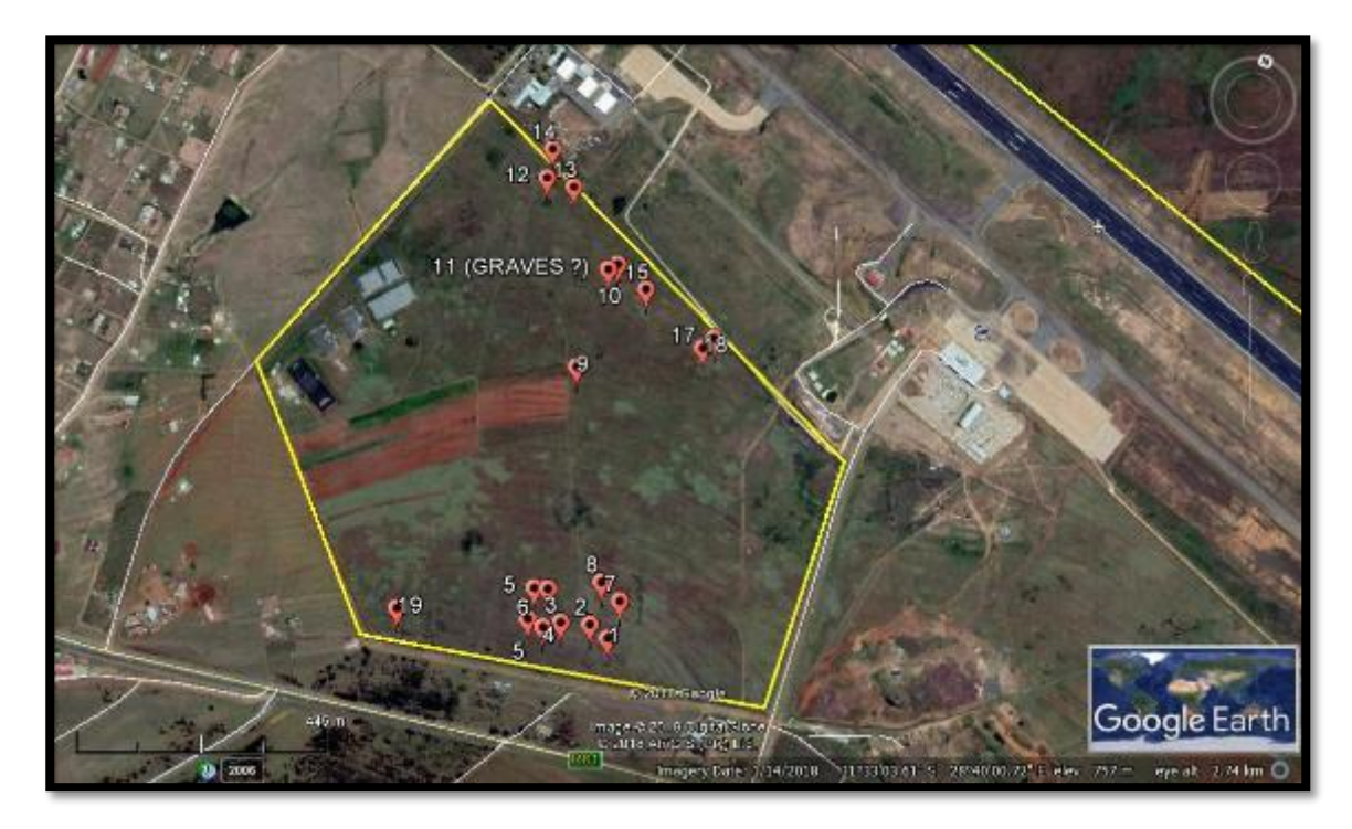
Figure 3. Google Earth Imagery showing the location of abandoned homesteads on Plot 2 (65Ha)