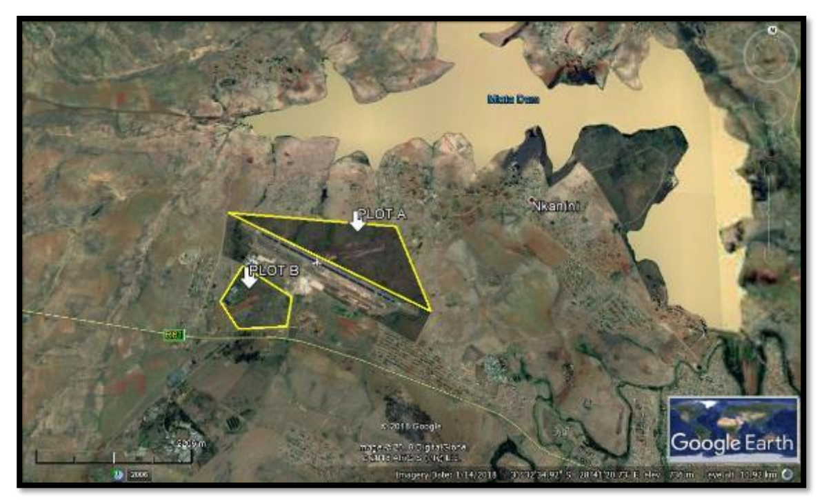
Figure 1. Google Aerial Imagery showing the location of Plot A and Plot B relative to the R61 and the Mthatha Dam.