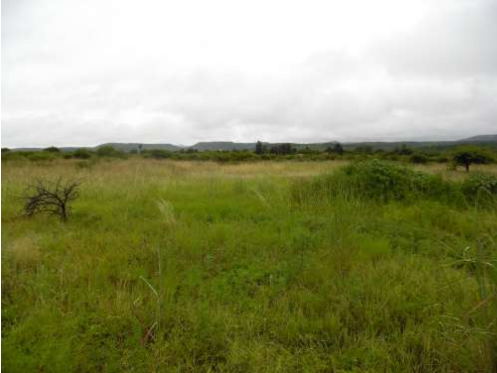
Photograph 5: Site characteristics