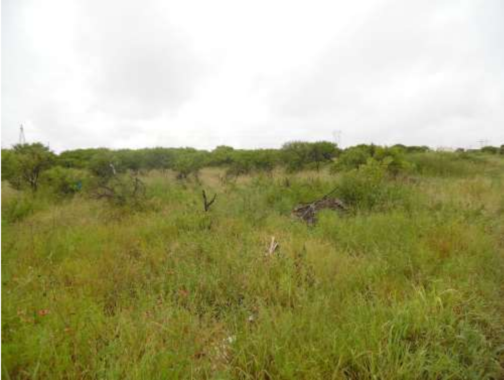
Photograph 3: Site characteristics