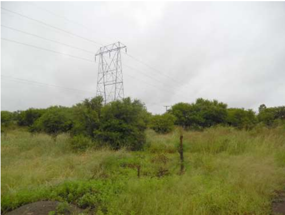
Photograph 6: Site characteristics