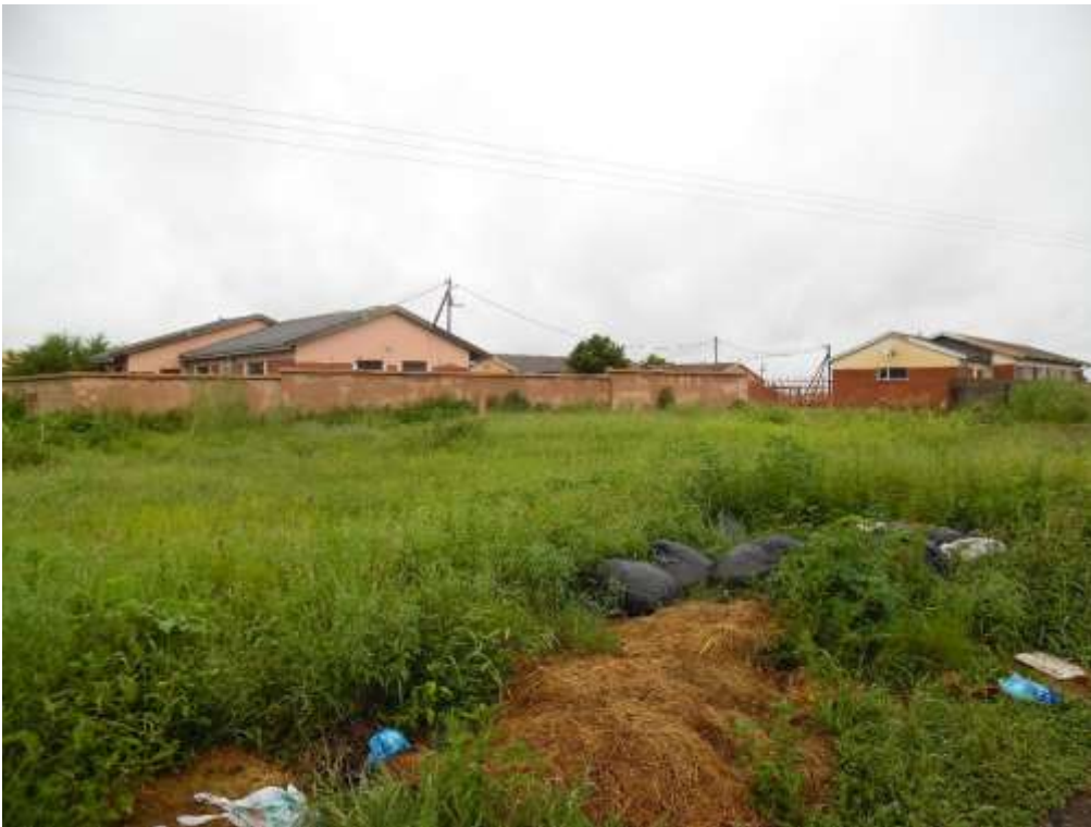
Photograph 4: Site characteristics