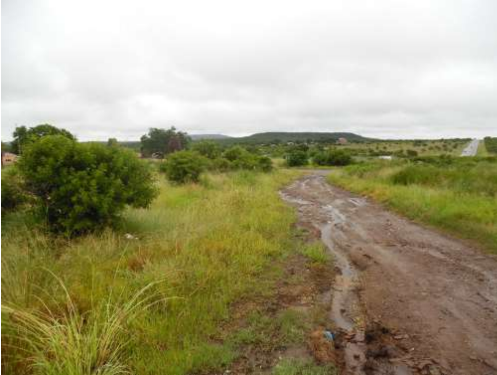
Photograph 1: Site characteristics