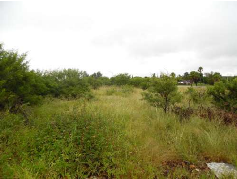
Photograph 2: Site characteristics