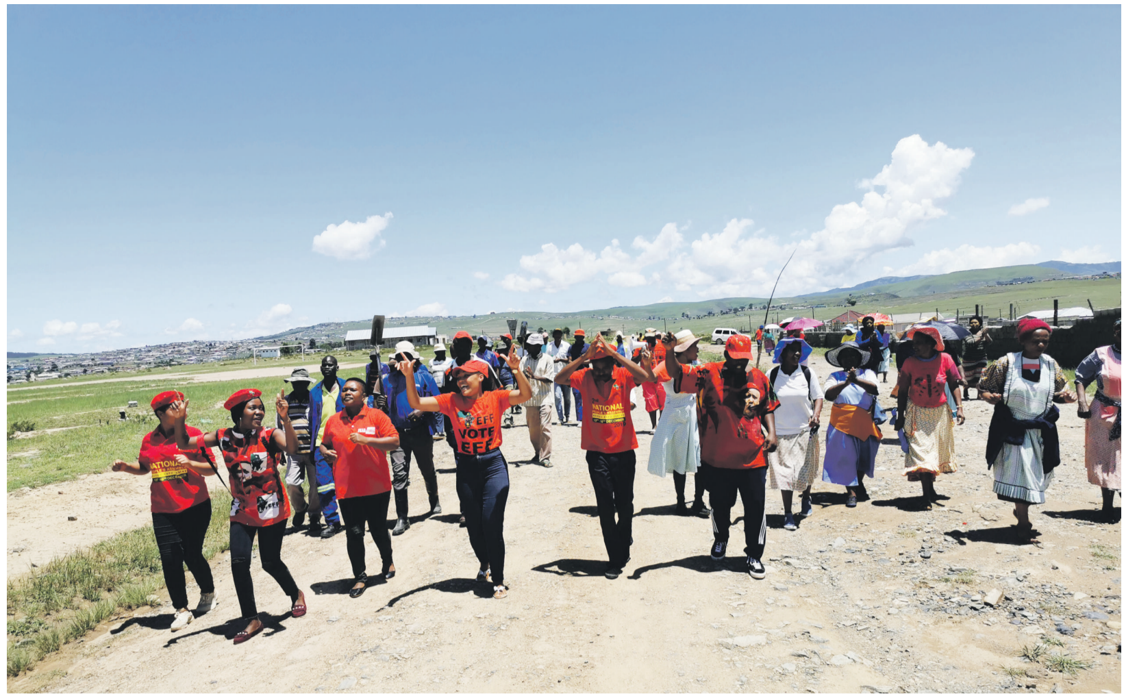
FURIOUS Villagers march - with EFF members - to the royal residence

He said they had raised the issue with the top leadership of the municipality who had also failed to act against the king, adding that the king did not have the right to close a community road.