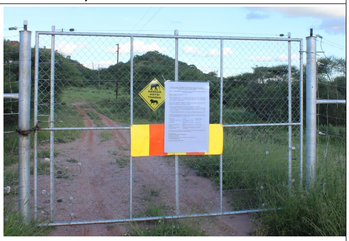
Site Notice: VLNR – Drumsheugh Gate