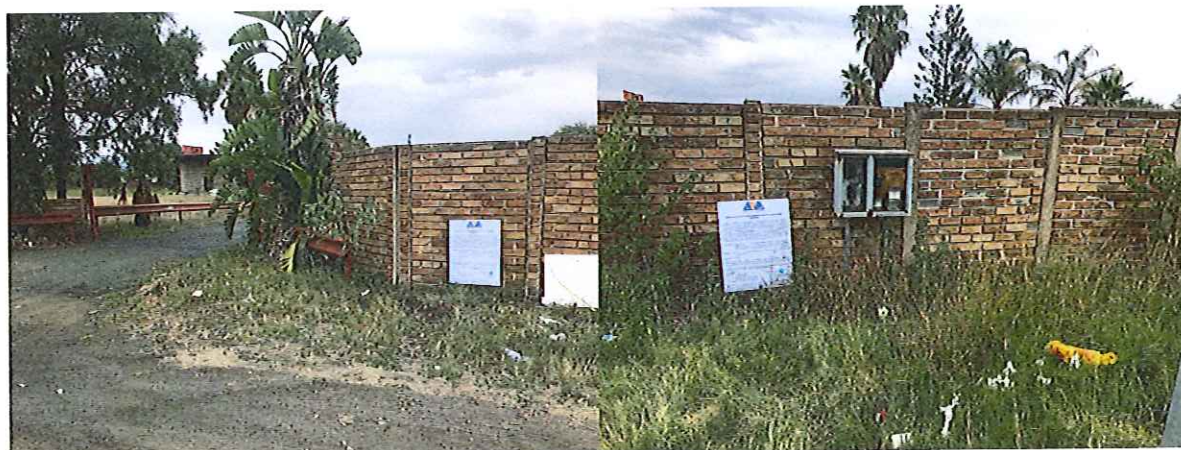
Notice 1: At entrance gate – Eastern boundary of property facing Ametis Street 25° 38' 01.3" South, 28° 07' 55.8" East