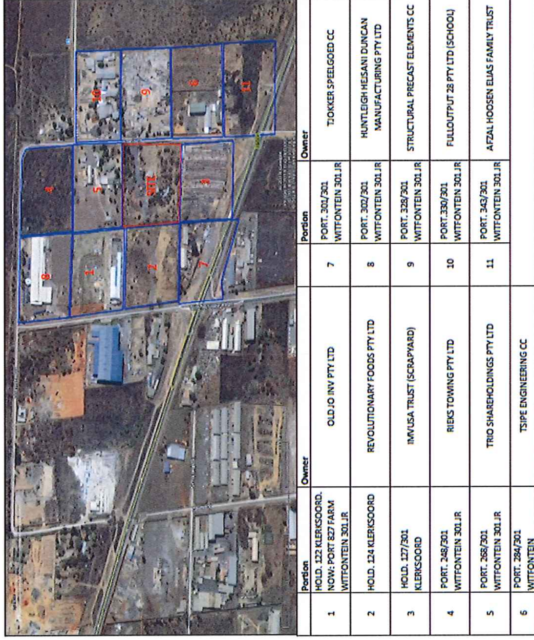
Figure 4: Notice distribution to surrounding neighbours and land owners in the area.