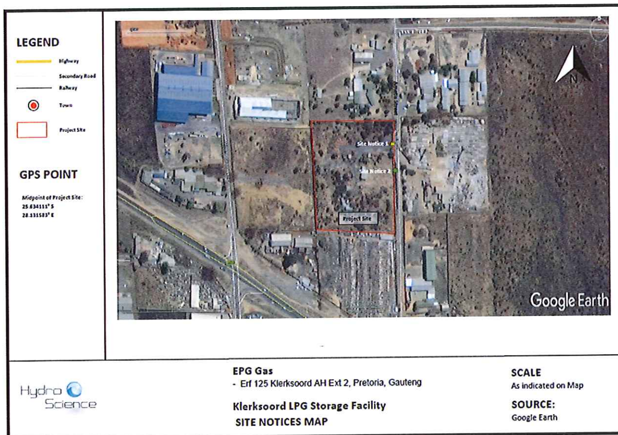
Figure 3: Aerial view of location of notices