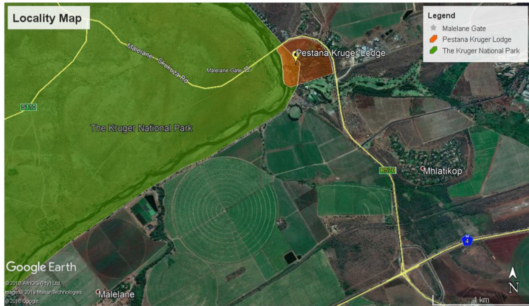
Figure 1: Proposed Development Site