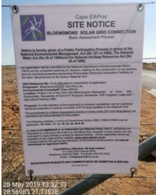
20 May 2019 13:32:33 28.5698S 21.1353E