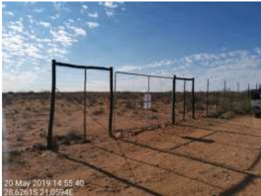
20 May 2019 14:55:40 28.6261S 21.0594E