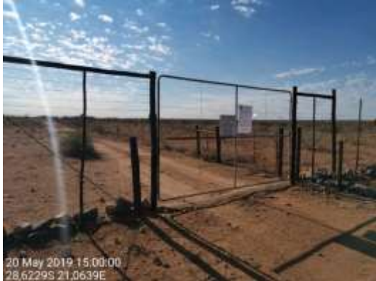
20 May 2019 15:00:00 28.6229S 21.0639E