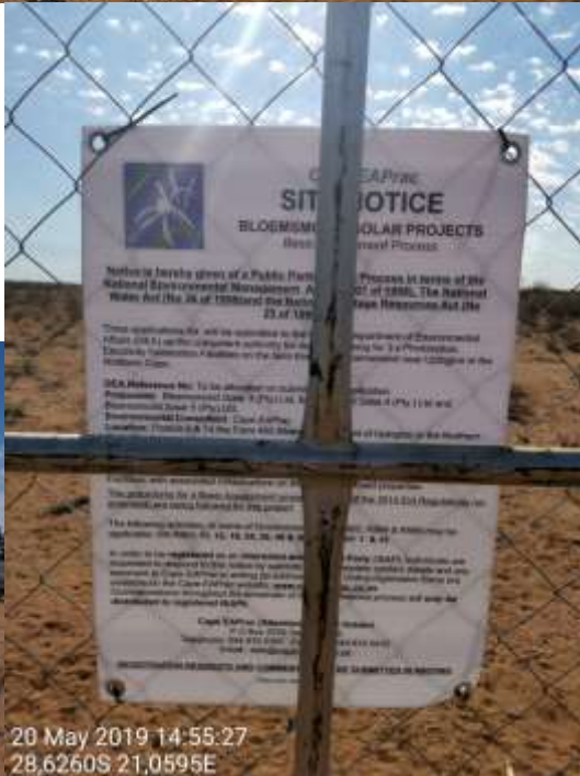
20 May 2019 14:55:27 28.6260S 21.0595E