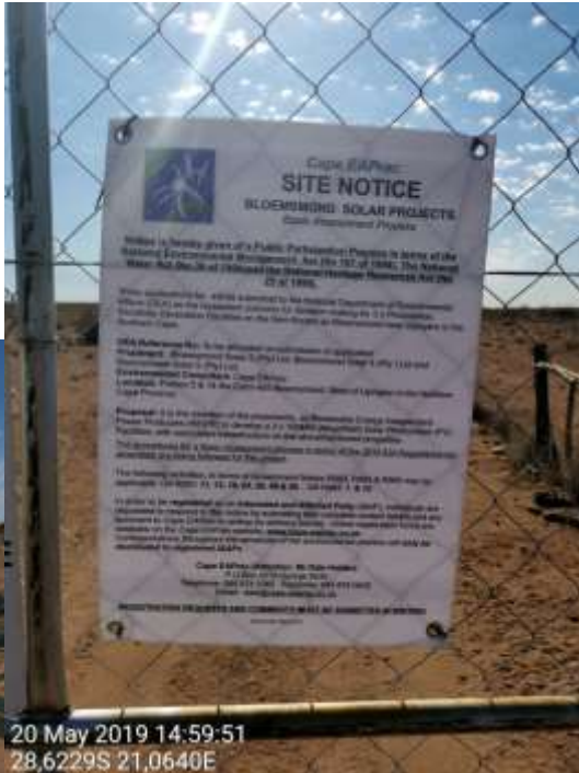
20 May 2019 14:59:51 28.6229S 21.0640E