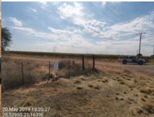
20 May 2019 13:20:27 28.5295S 21.1633E