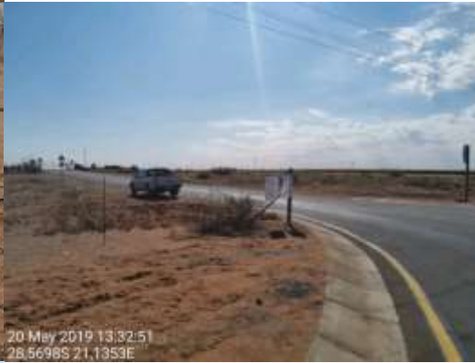
20 May 2019 13:32:51 28.5698S 21.1353E