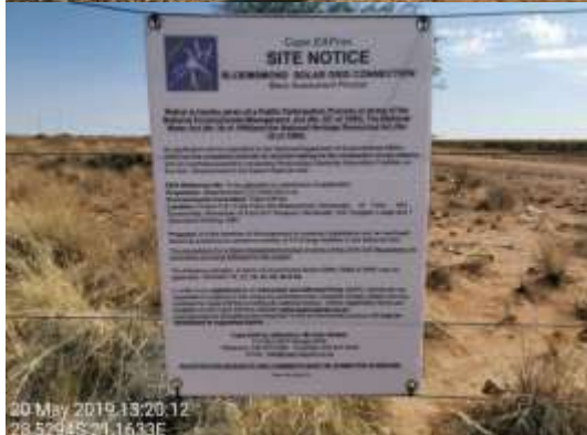
20 May 2019 13:20:12 28.5294S 21.1633E