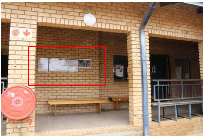
e) Casteel, Thusong Service Centre, Labour Offices