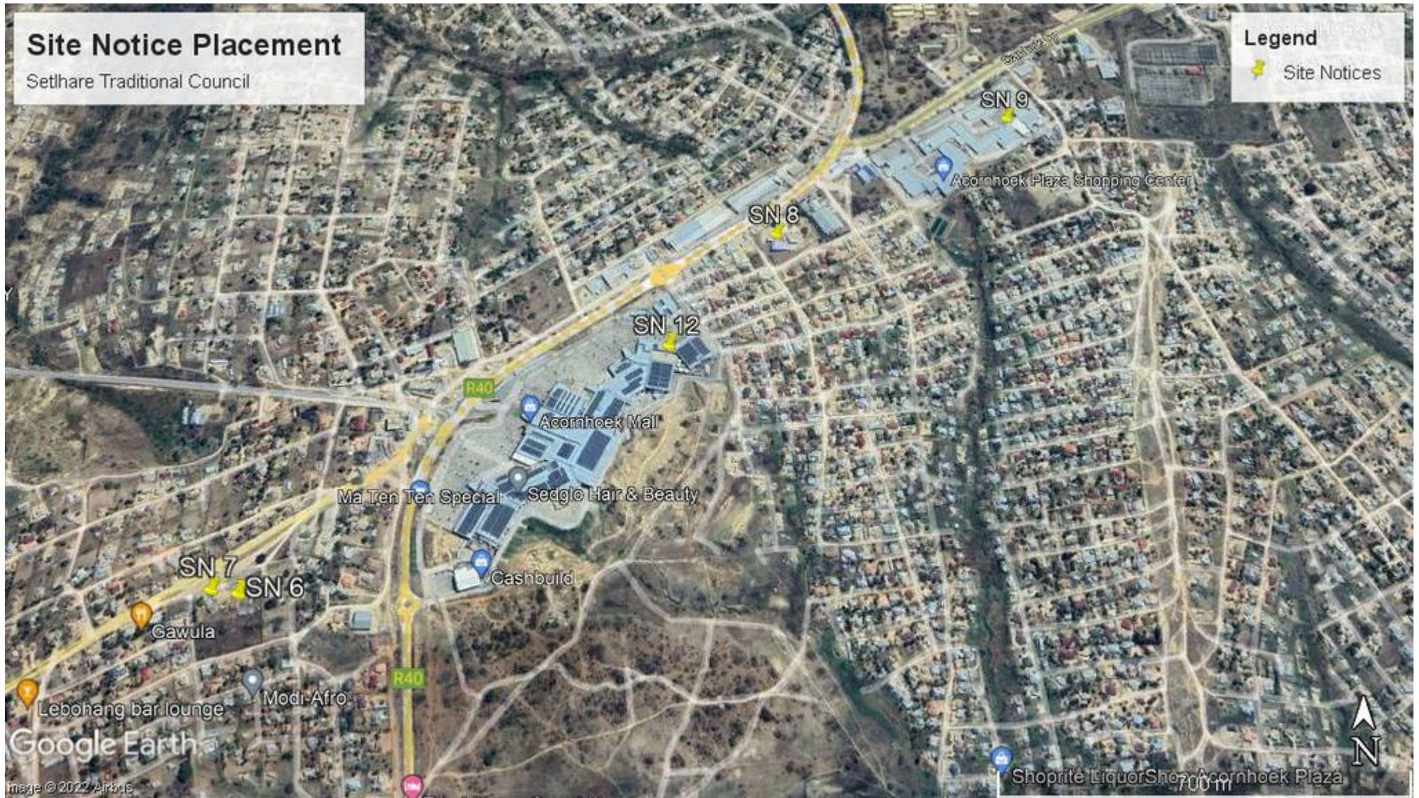
Figure 13: Locality Map showing the location of site notices placed in the Acornhoek area within the Setlhare Traditional Council Area