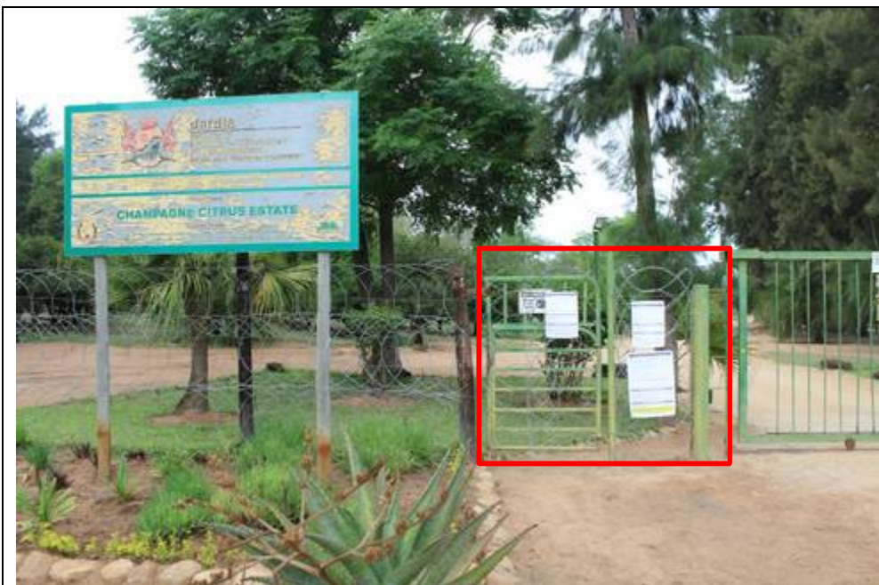
k) Champagne Citrus Estate entrance gate.