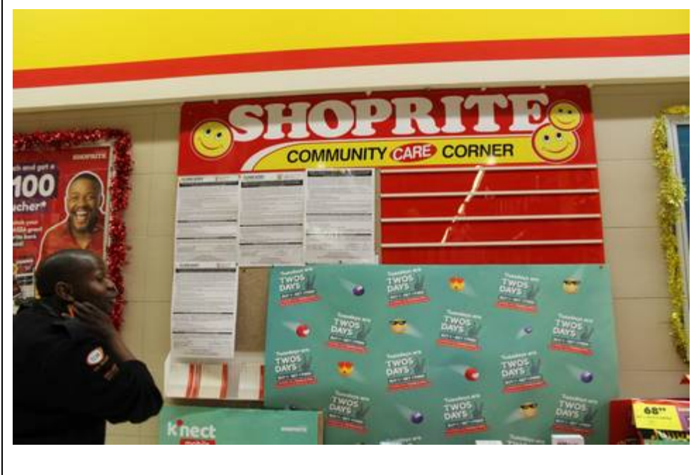
l) Shoprite (notice board), Acornhoek Mall, next to the R40.

Notice placed in English, Sepedi, Sesotho and Xitsonga