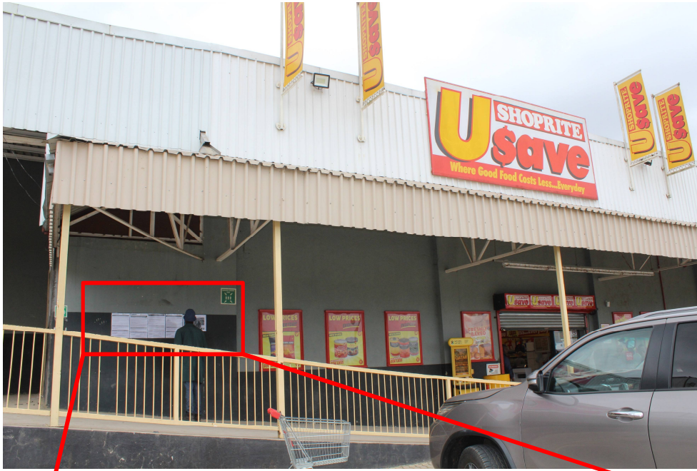
d) U-Save Casteel, next to R40 road