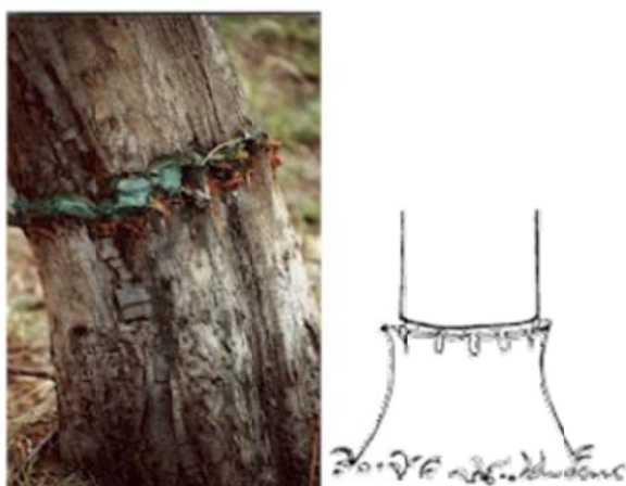
The Frilling Method