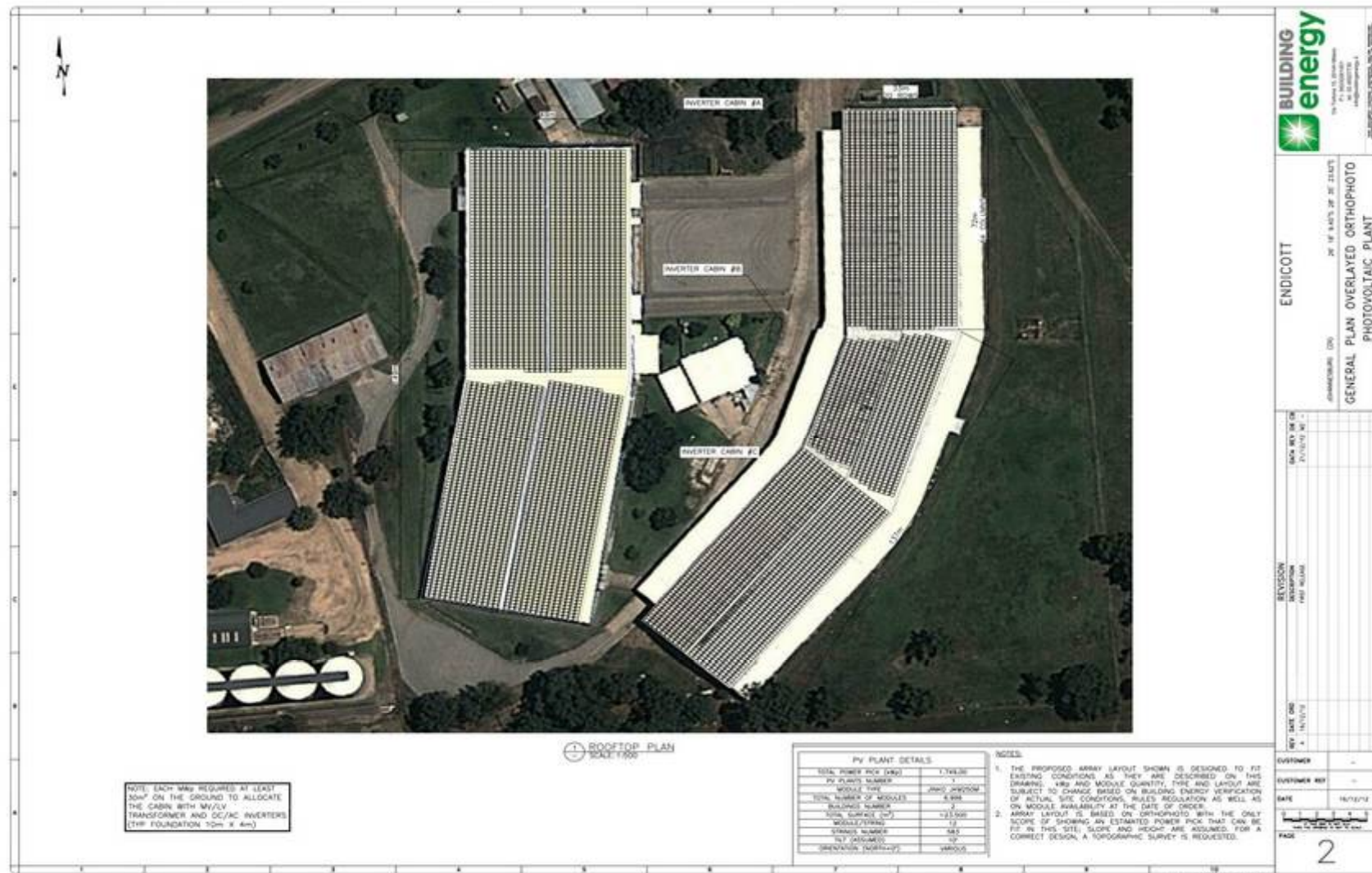
Figure 2: Preliminary Layout Map for the proposed Kynoch Rooftop Solar Energy Facility