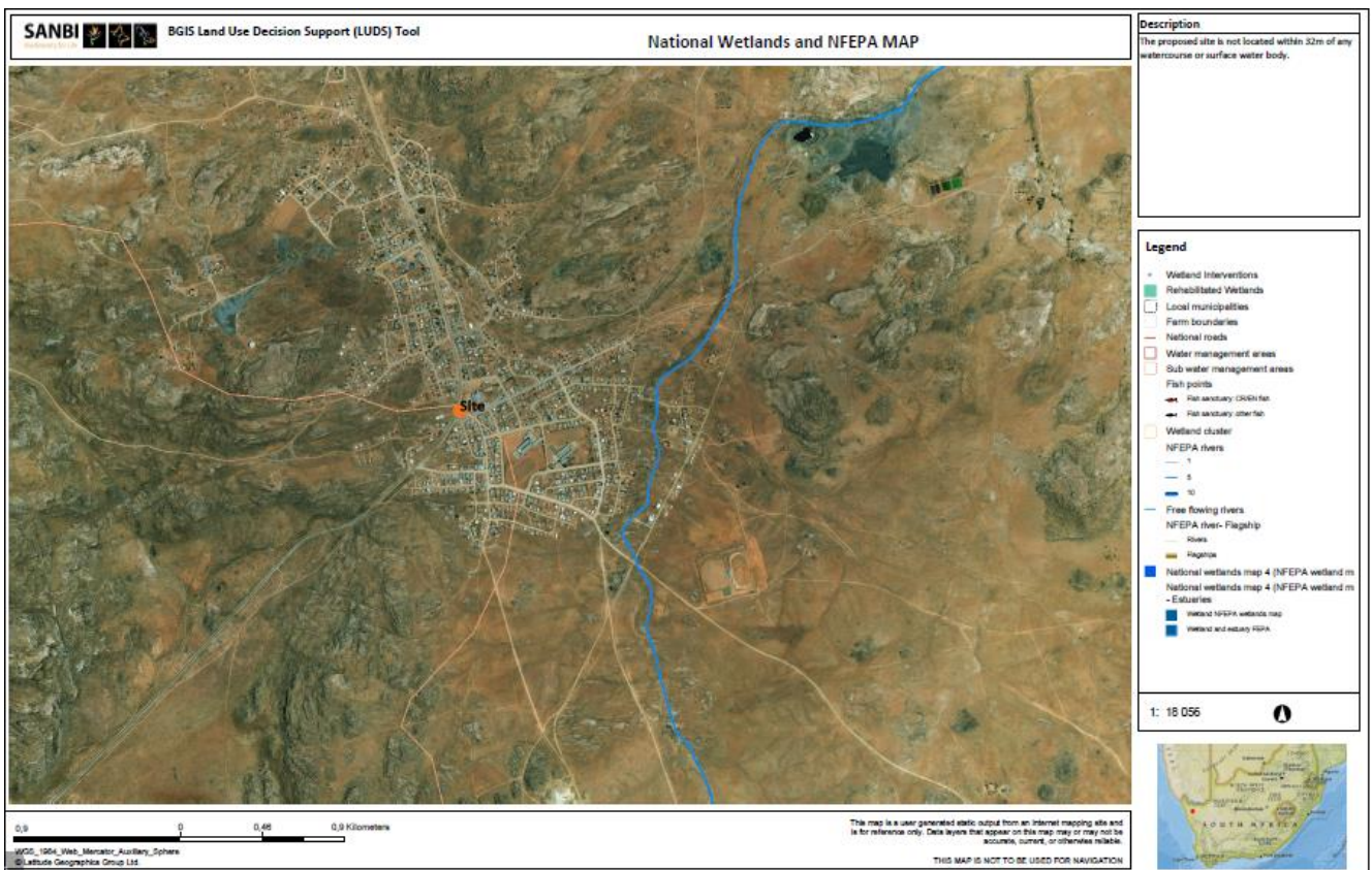
Figure 3: National Freshwater Ecosystem Priority Areas (NFEPA) Map of the proposed site (orange dot) and surroundings.