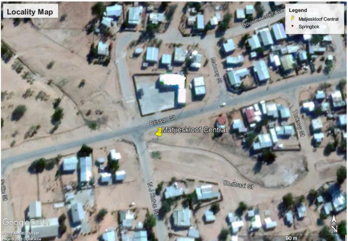
Figure 1: Google Earth aerial view of the proposed site location (yellow placemark). The site will be accessed via Brisson Street.

three future service provider equipment containers. There is no natural vegetation on site, and the site is totally transformed due to past development activities on the property. The proposed site is located to the north of a stormwater channel and there are no watercourses on site. The mast's base station will be closed with a steel palisade fence. Electricity to power the mast will be sourced from the land owner. The site has no slope and is located on a flat surface area. The site co-ordinates are 31°28'8.18"S 19°46'12.63"E .