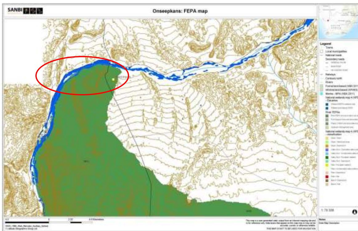
Figure 4: NFEPA (National Freshwater Ecosystem Priority Areas) Map of Onseepkans