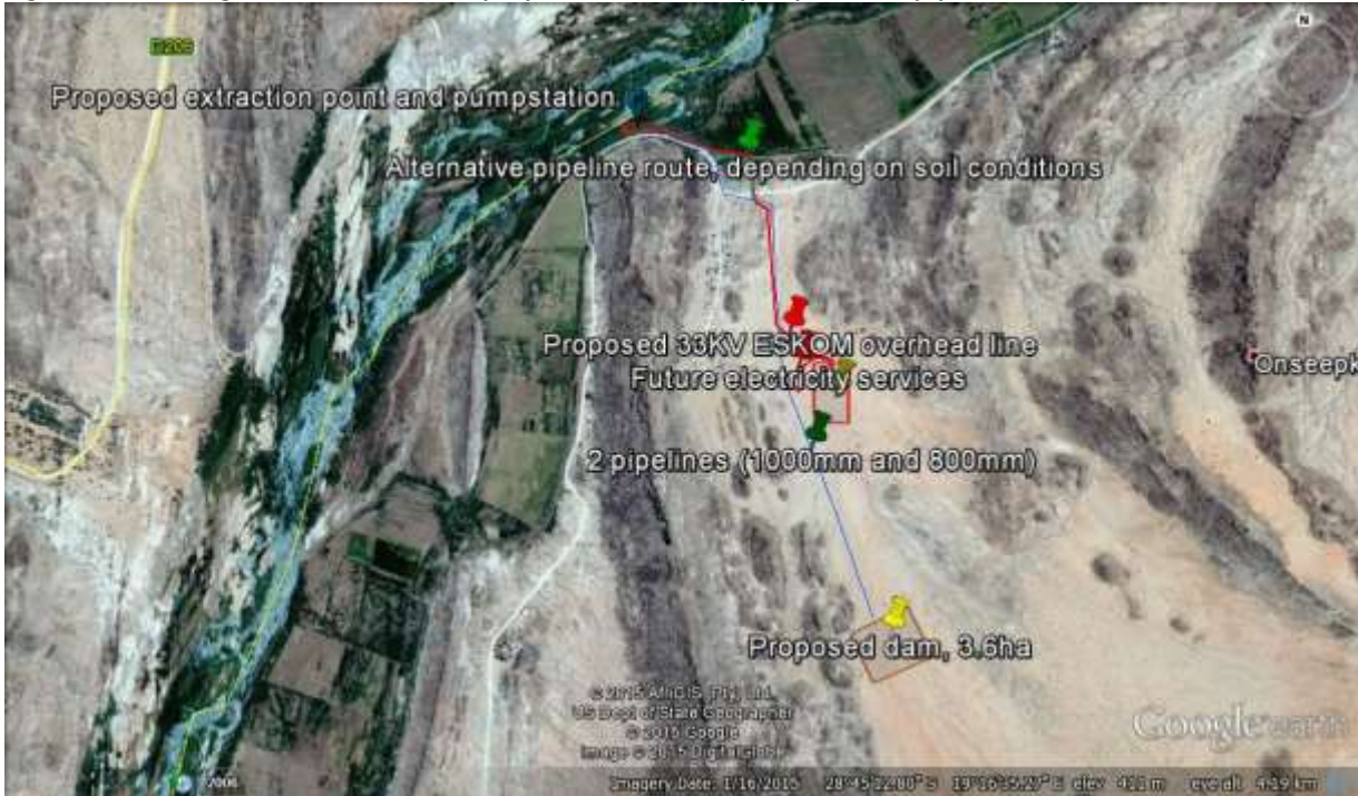
Figure 1: Showing the location of the proposed dam, SPV, pumpstation, pipeline and overhead cables