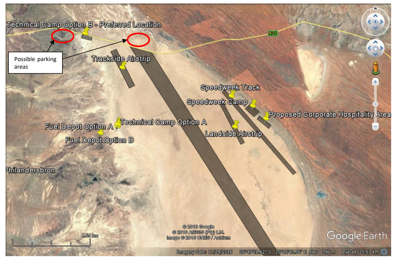
Figure 1: Google Earth image showing the various infrastructure and components of the Bloodhound SSC project (including the various options/alternatives) at Hakskeen Pan.