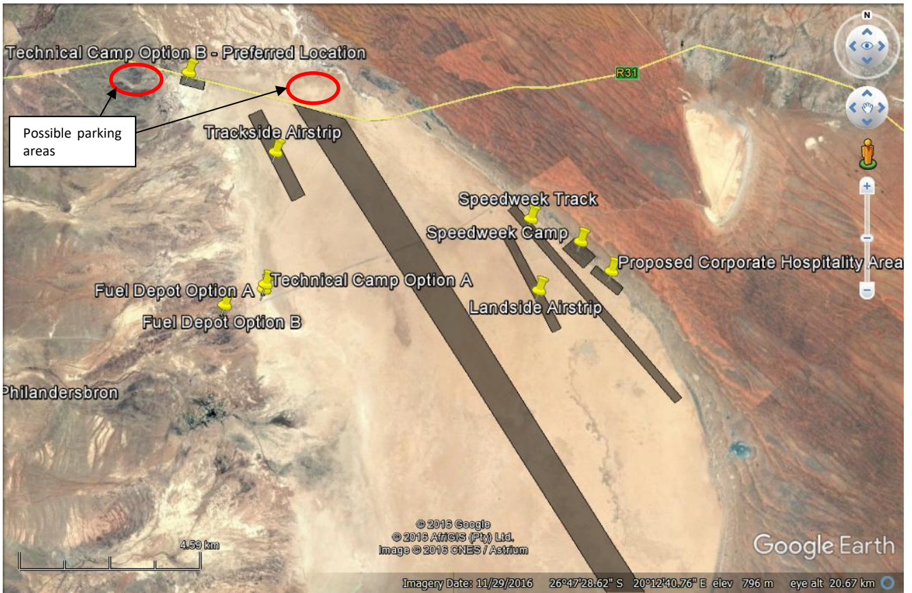
Figure 1: Google Earth image showing the various infrastructure and components of the Bloodhound SSC project (including the various options/alternatives) at Hakskeen Pan.