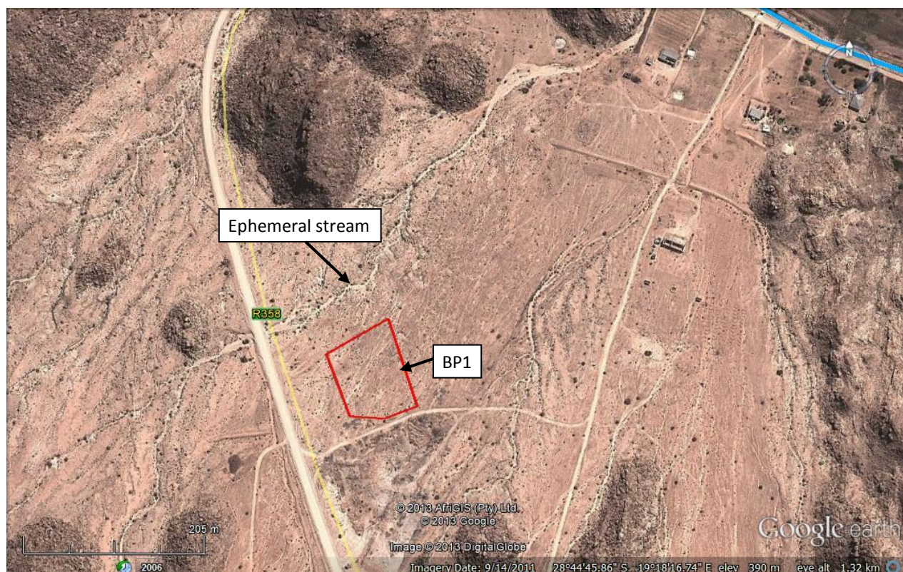
FIGURE 2: GOOGLE OVERVIEW OF THE PROPOSED LOCATION OF BORROW PIT 1