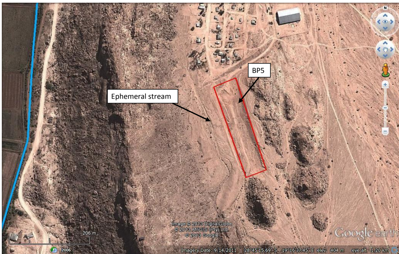
FIGURE 6: GOOGLE OVERVIEW OF THE PROPOSED LOCATION OF BORROW PIT 5