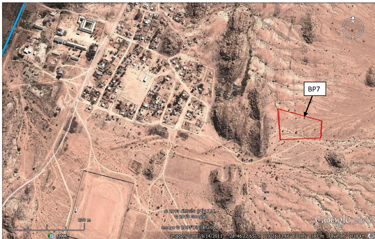
FIGURE 8: GOOGLE OVERVIEW OF THE PROPOSED LOCATION OF BORROW PIT 7