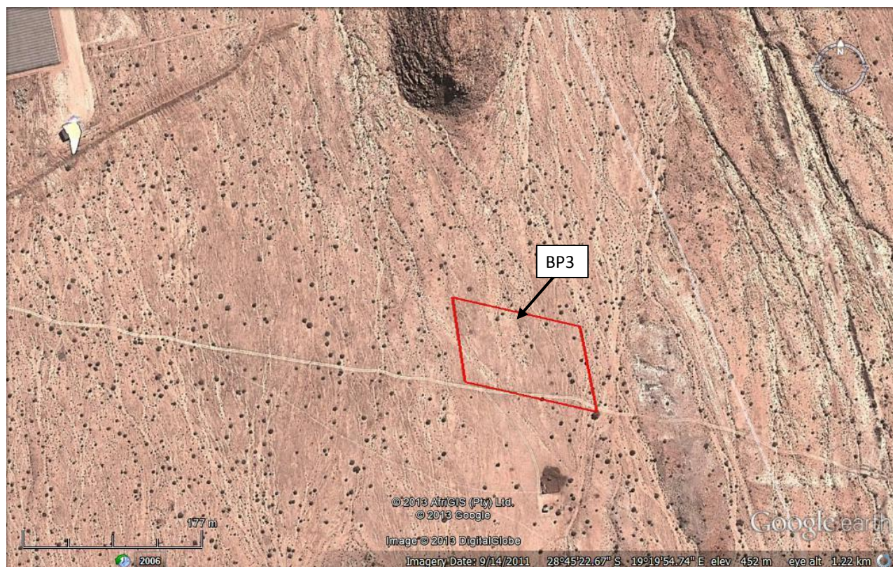
FIGURE 4: GOOGLE OVERVIEW OF THE PROPOSED LOCATION OF BORROW PIT 3