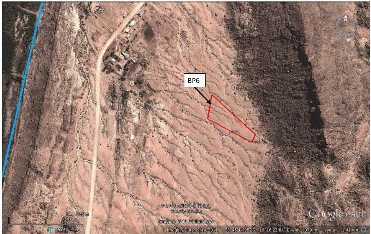
FIGURE 7: GOOGLE OVERVIEW OF THE PROPOSED LOCATION OF BORROW PIT 6