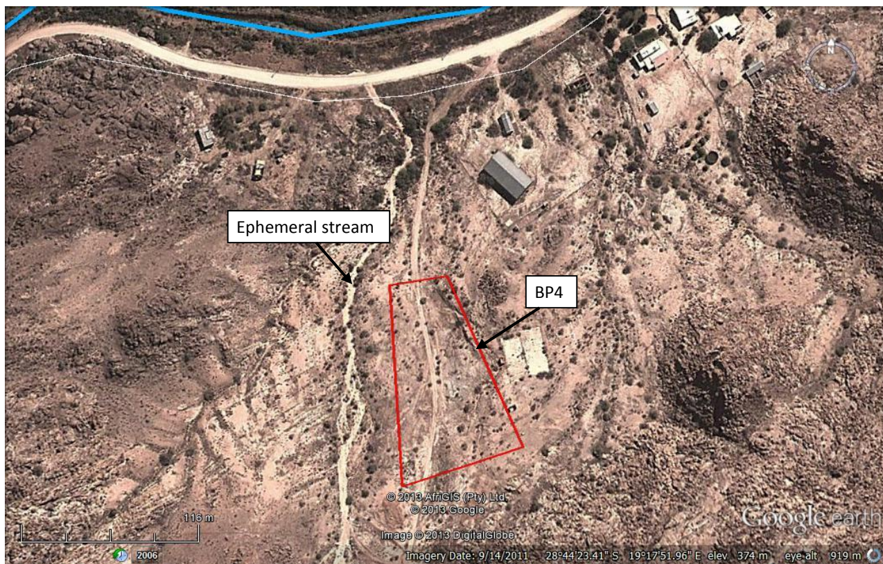
FIGURE 5: GOOGLE OVERVIEW OF THE PROPOSED LOCATION OF BORROW PIT 4